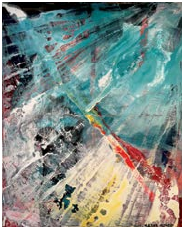
94 x 75 cm