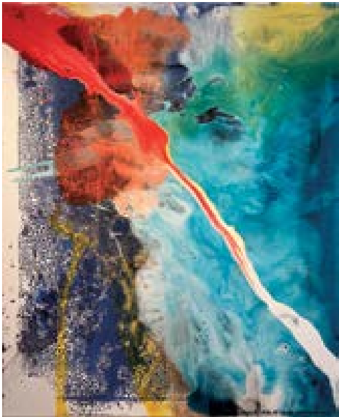
64 × 52 cm