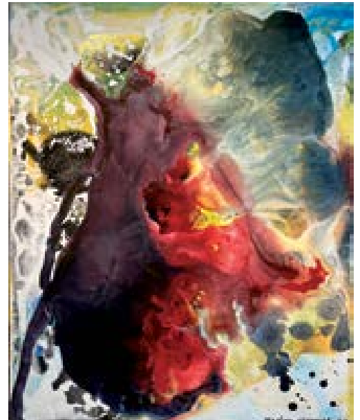
64 × 52 cm