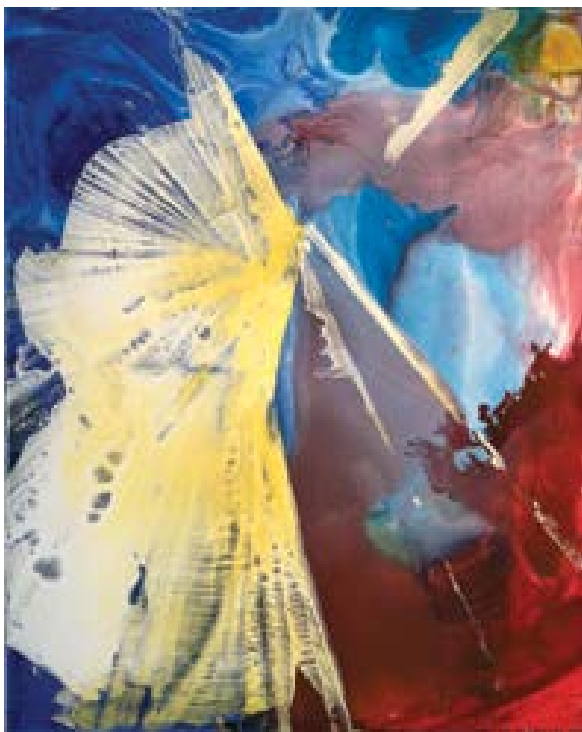
94 x 75 cm