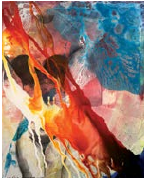
64 × 52 cm