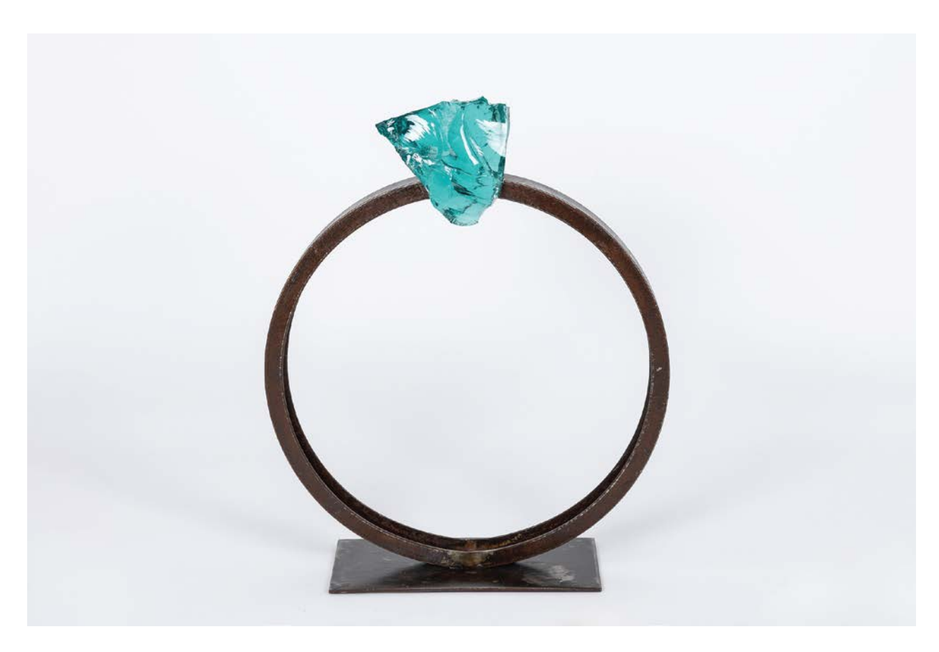
Ring (2025) iron and glass 65x50x20 cm