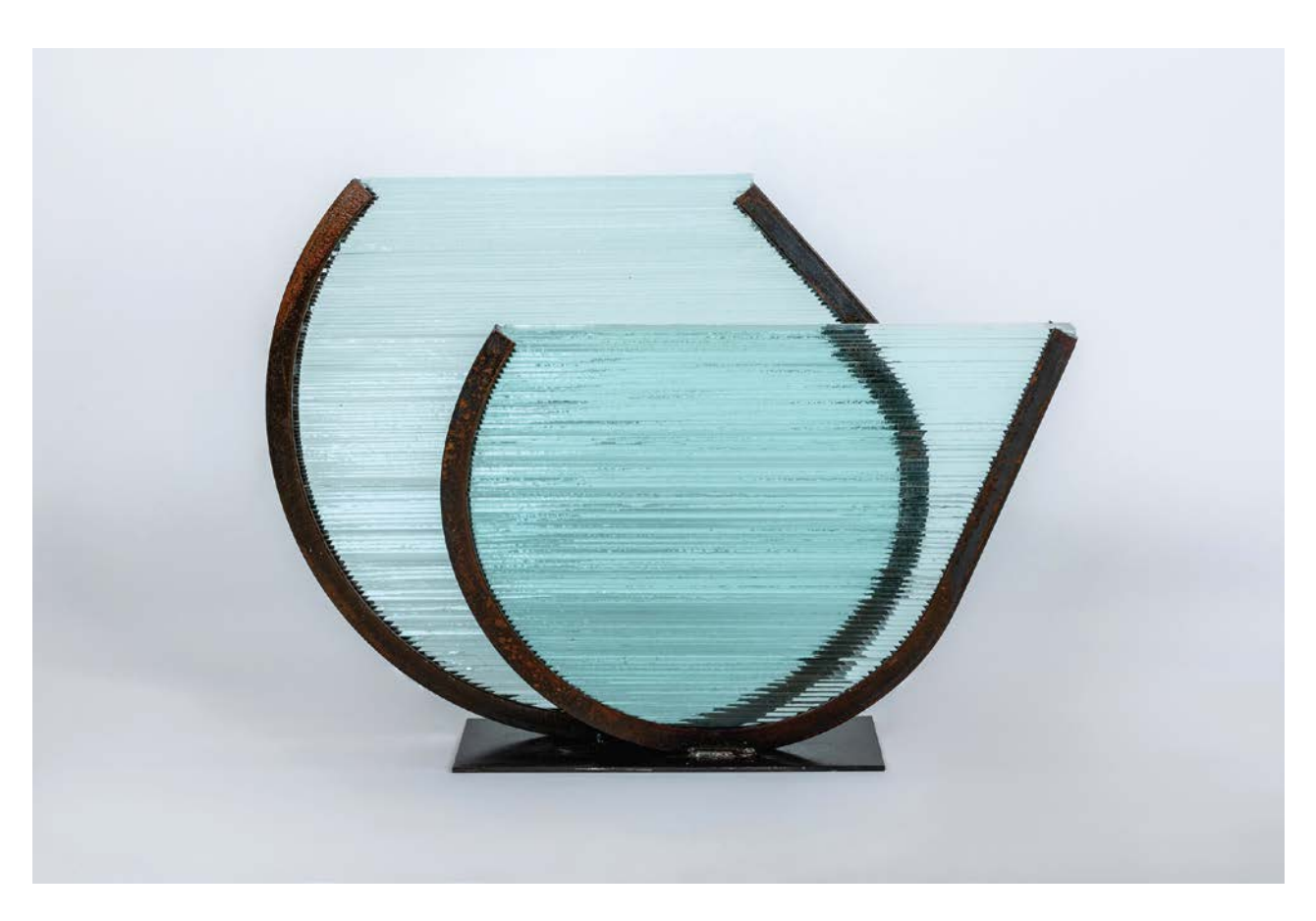
Geometric Motion (2025) iron and glass 55x80x20 cm