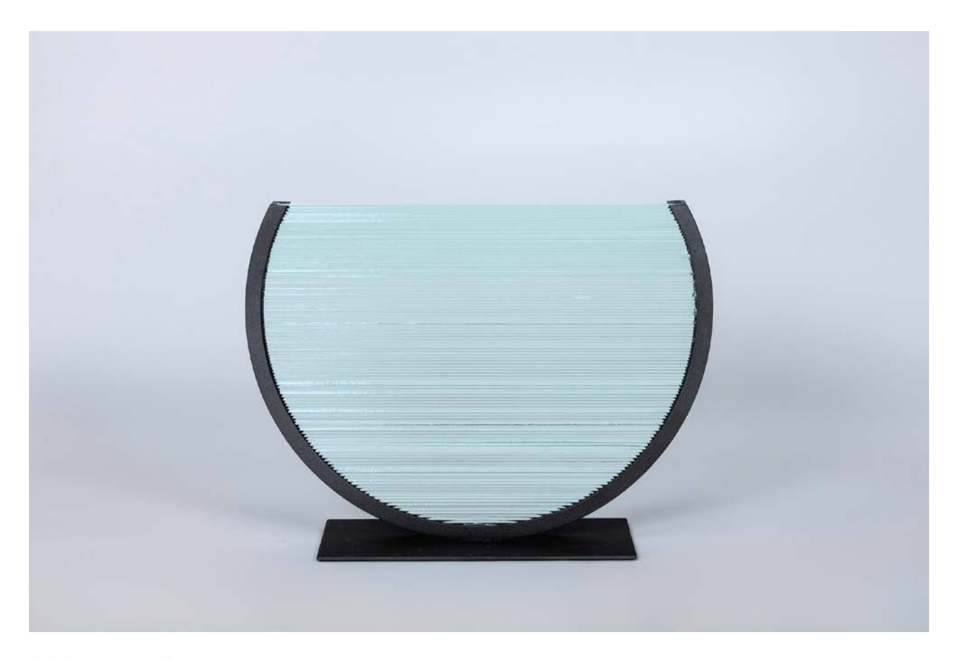
Fulfillment (2025) iron and glass 45×60×20 cm