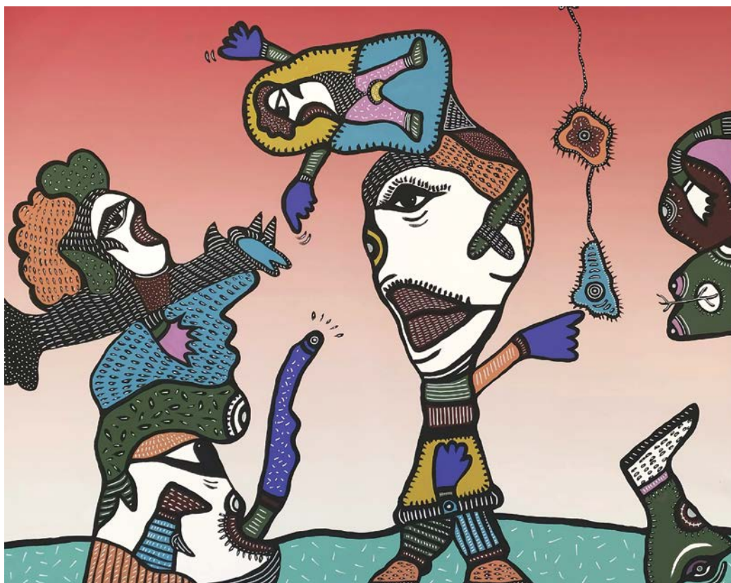
Enjoy (2025) mixed media on canvas 145x183 cm