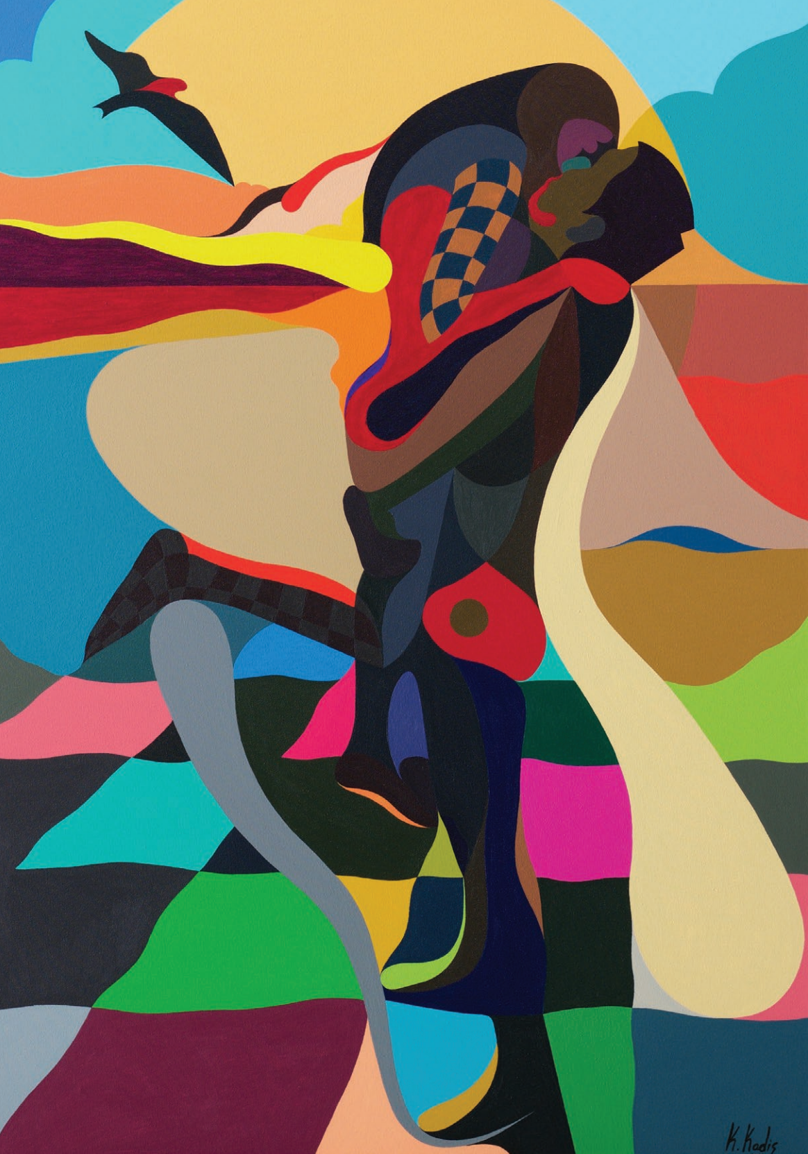
When Everything is Colored acrylic on canvas 100x70