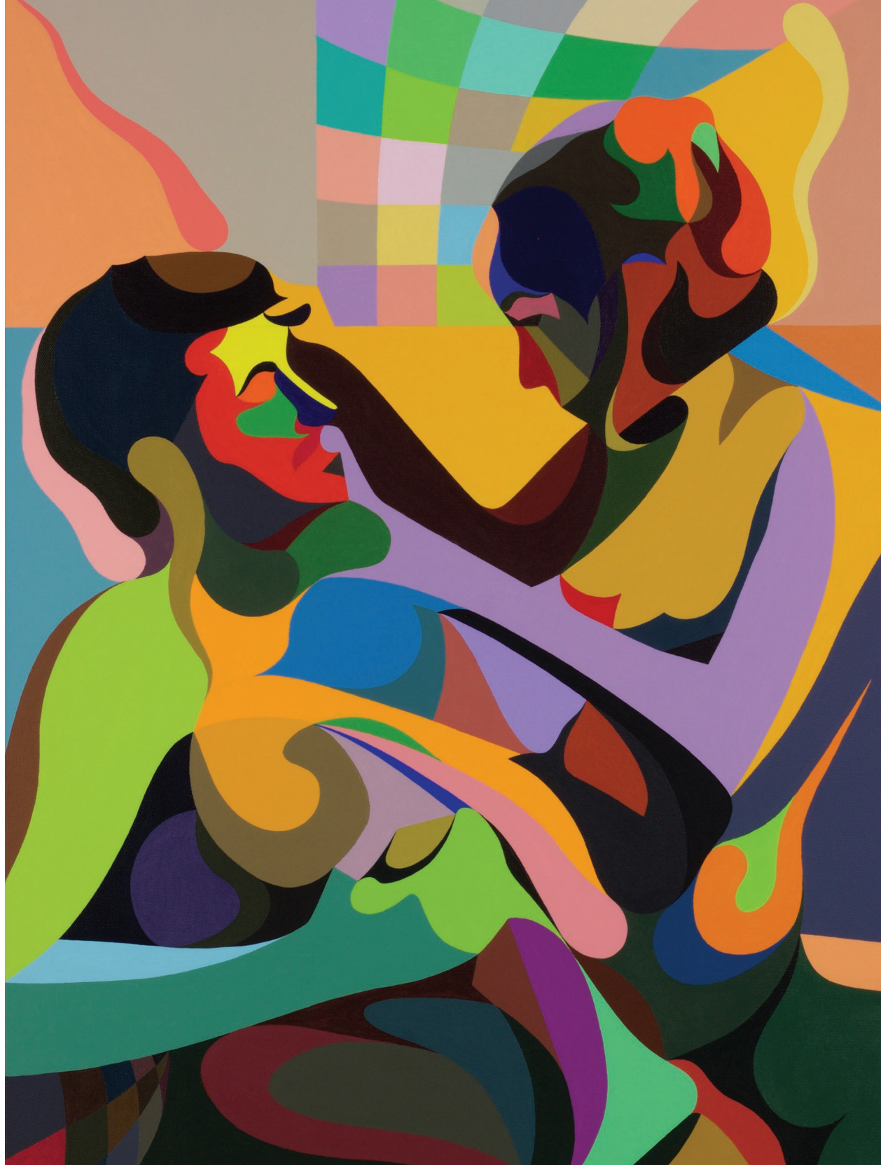
Chemical Reaction acrylic on canvas 90x60