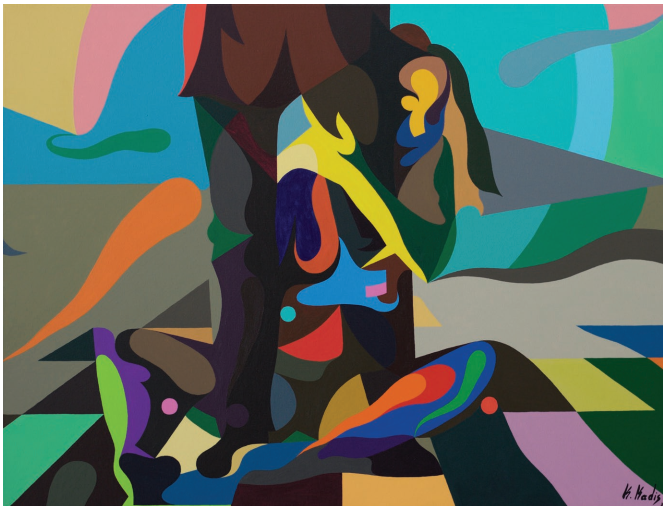
Repentance acrylic on canvas 60x80