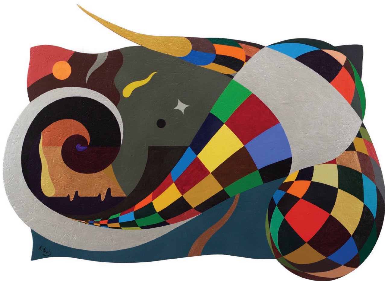
The Touch acrylic on wood 110x150