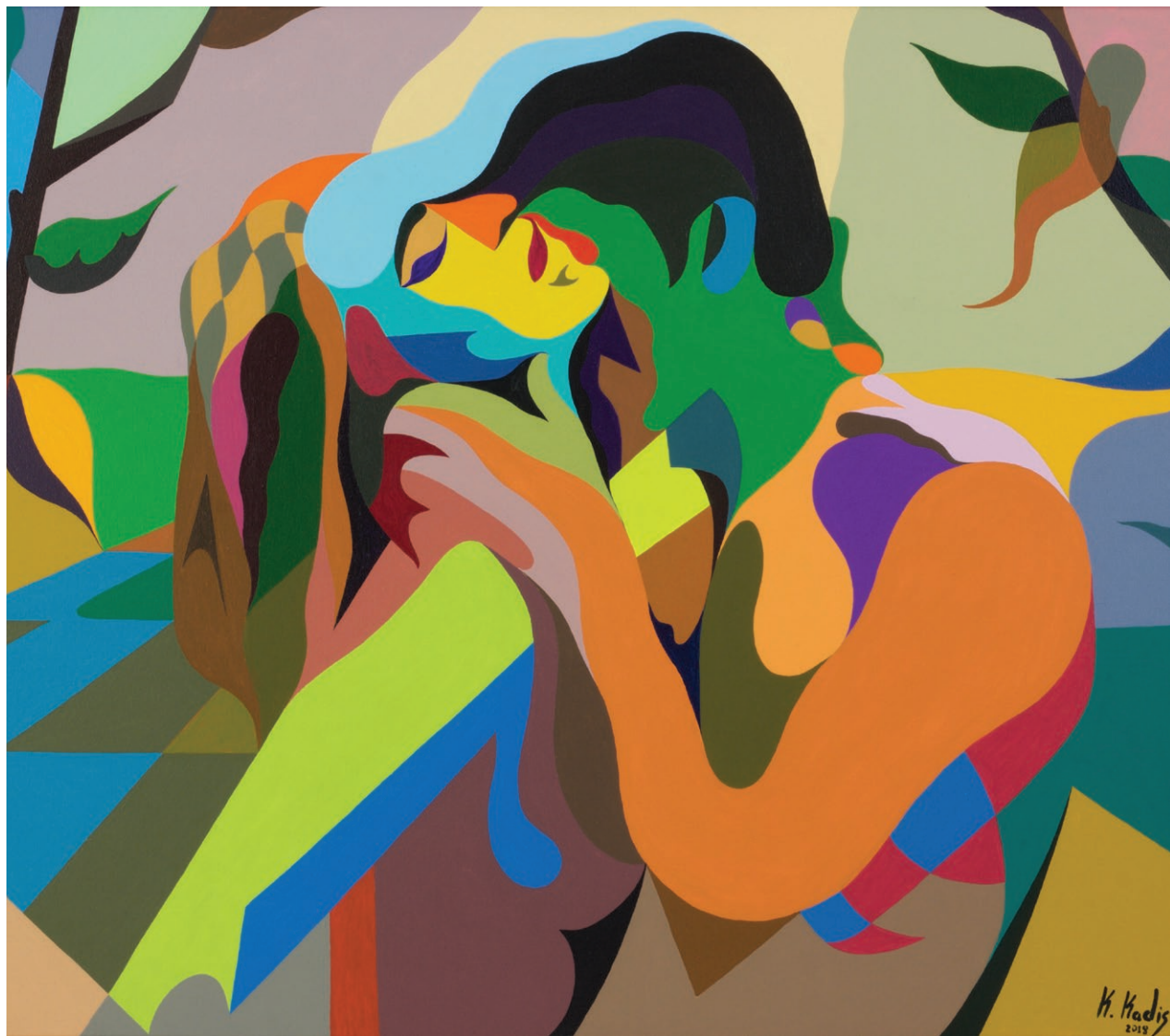
A Special Meeting acrylic on canvas 60x70