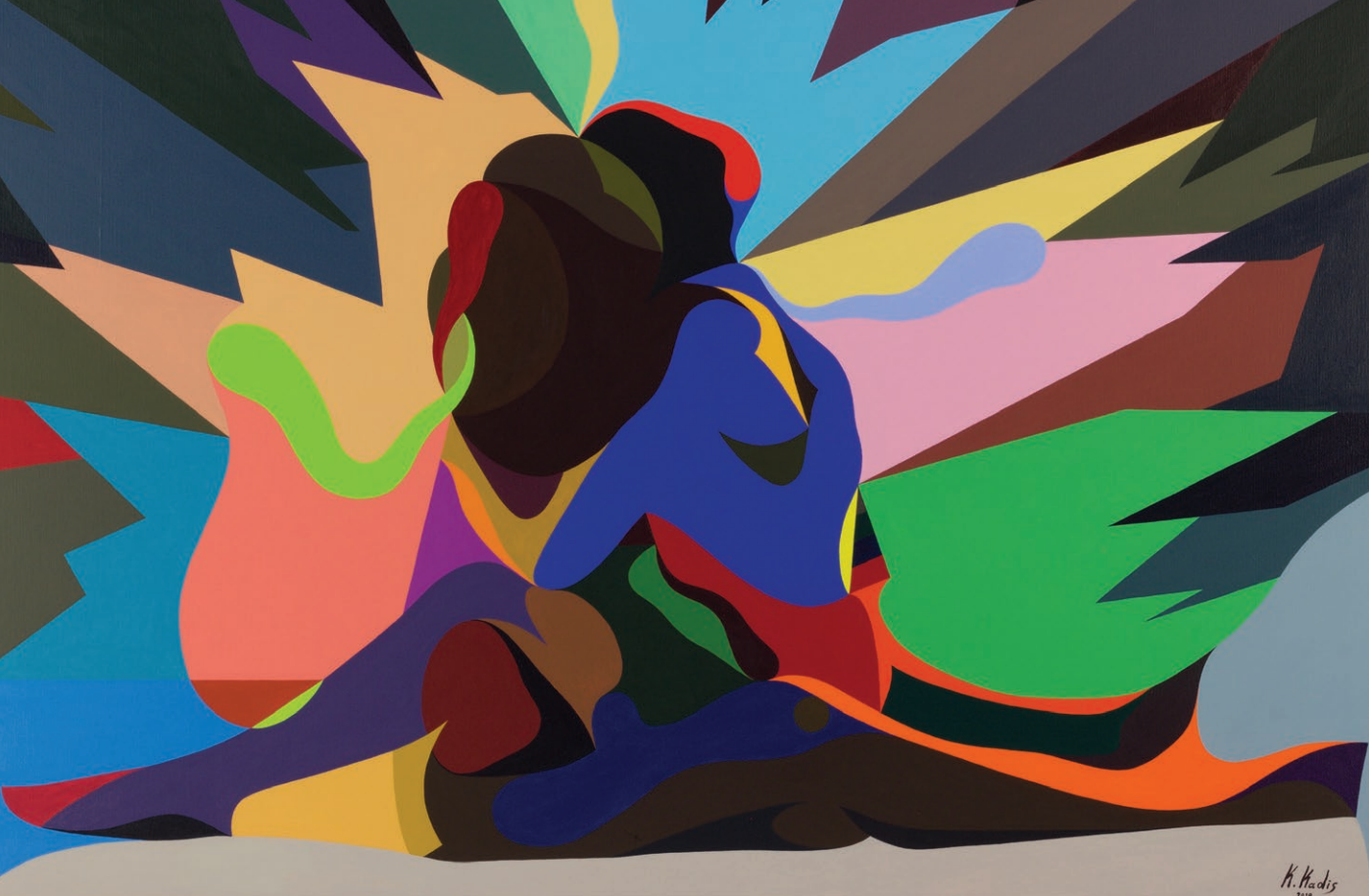
Color vs Light acrylic on canvas 80x120