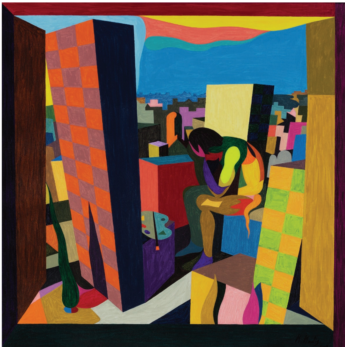
The Unseen Connection acrylic on canvas 60x60