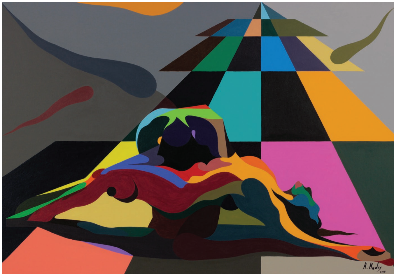
Loss acrylic on canvas 70x100