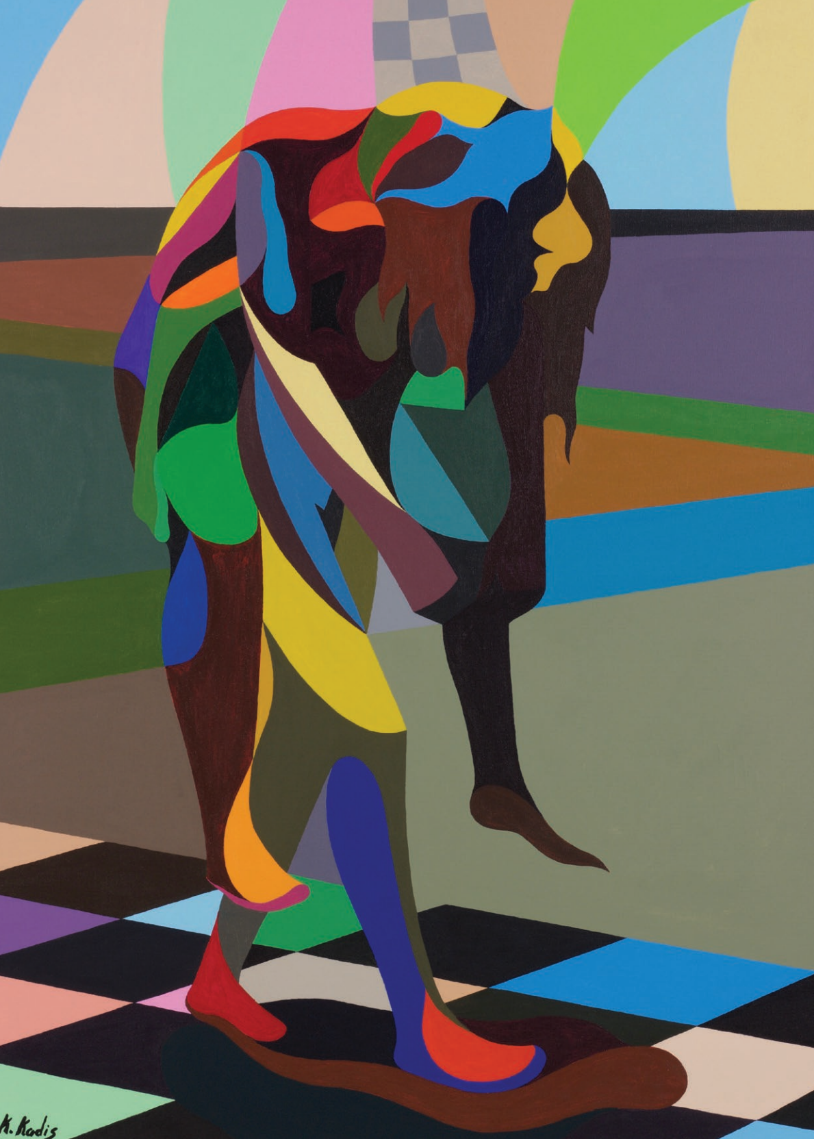
A Couple Lost in Time acrylic on canvas 70x50