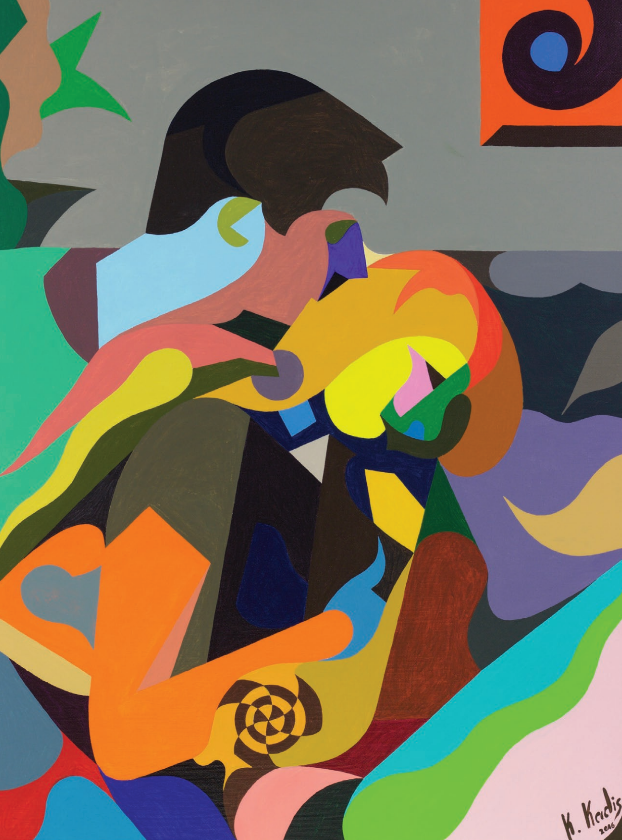
Beautiful Feelings acrylic on canvas 73x54