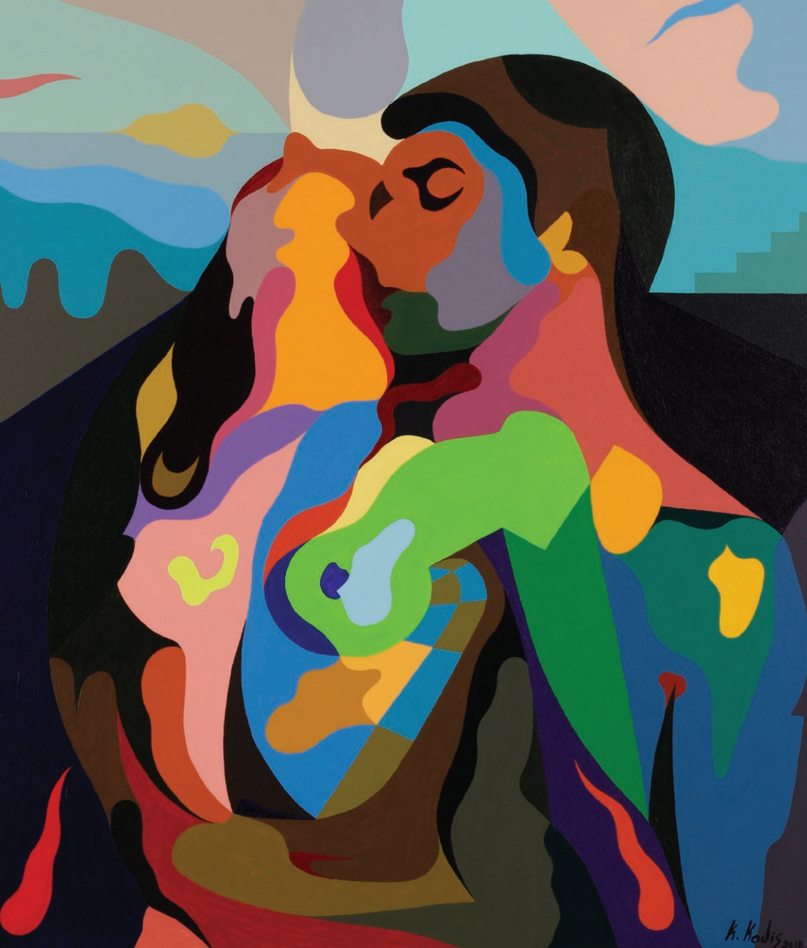
Love acrylic on canvas 70x60