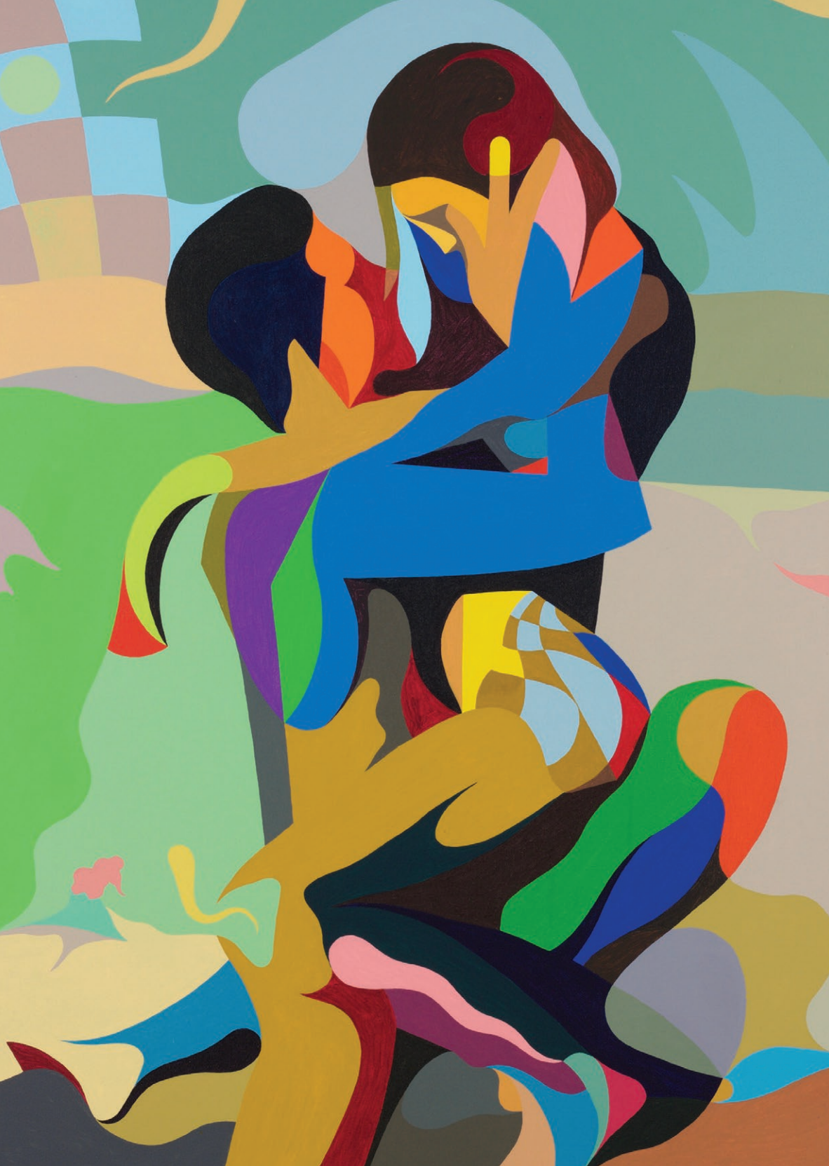
Special Timing acrylic on canvas 90x60