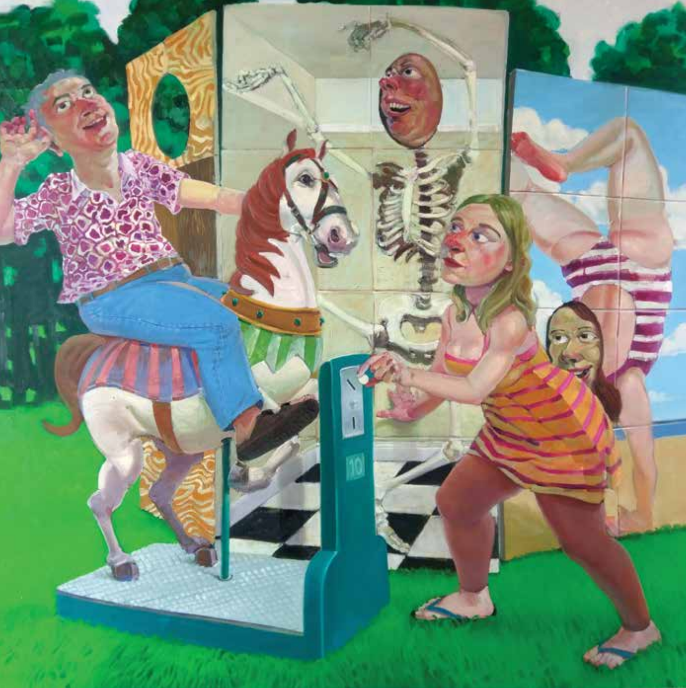
Father's Day (2018) oil on canvas 148x148