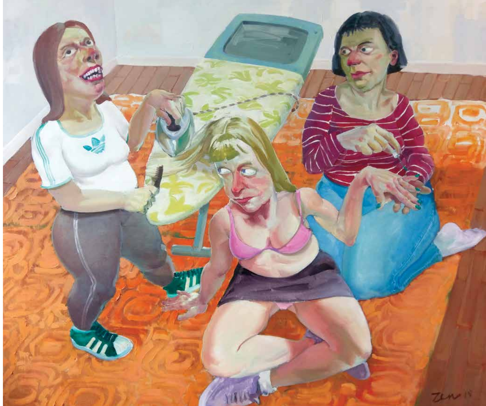
Straightened Hair and Painted Nails (2018) oil on canvas 115x134