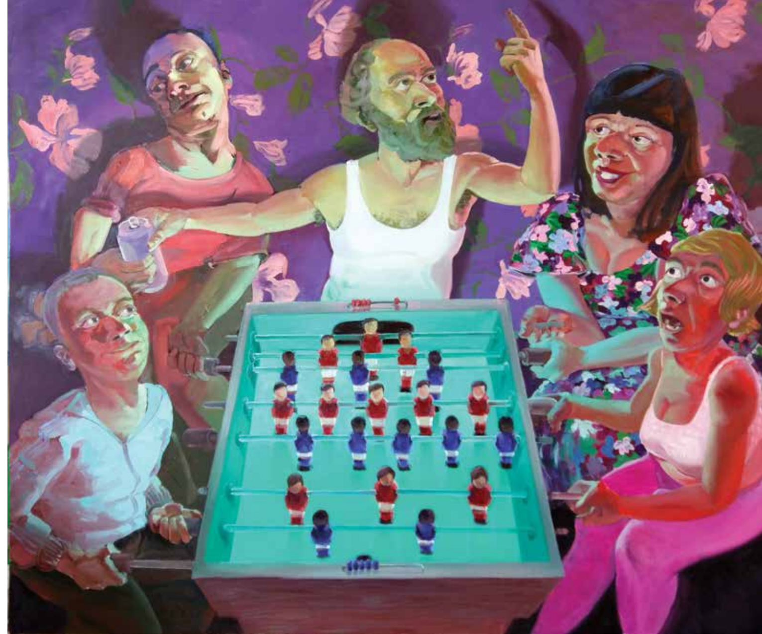
The Socratic Method (2018)