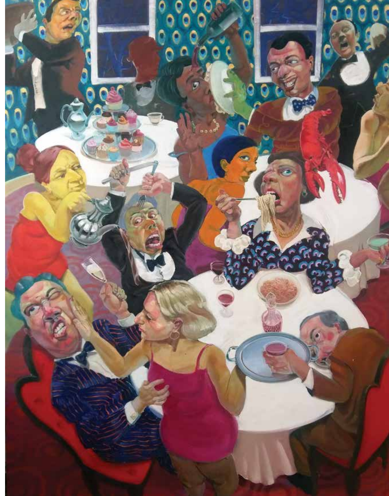
Lobster and Cupcakes (2019) oil on canvas 190x150