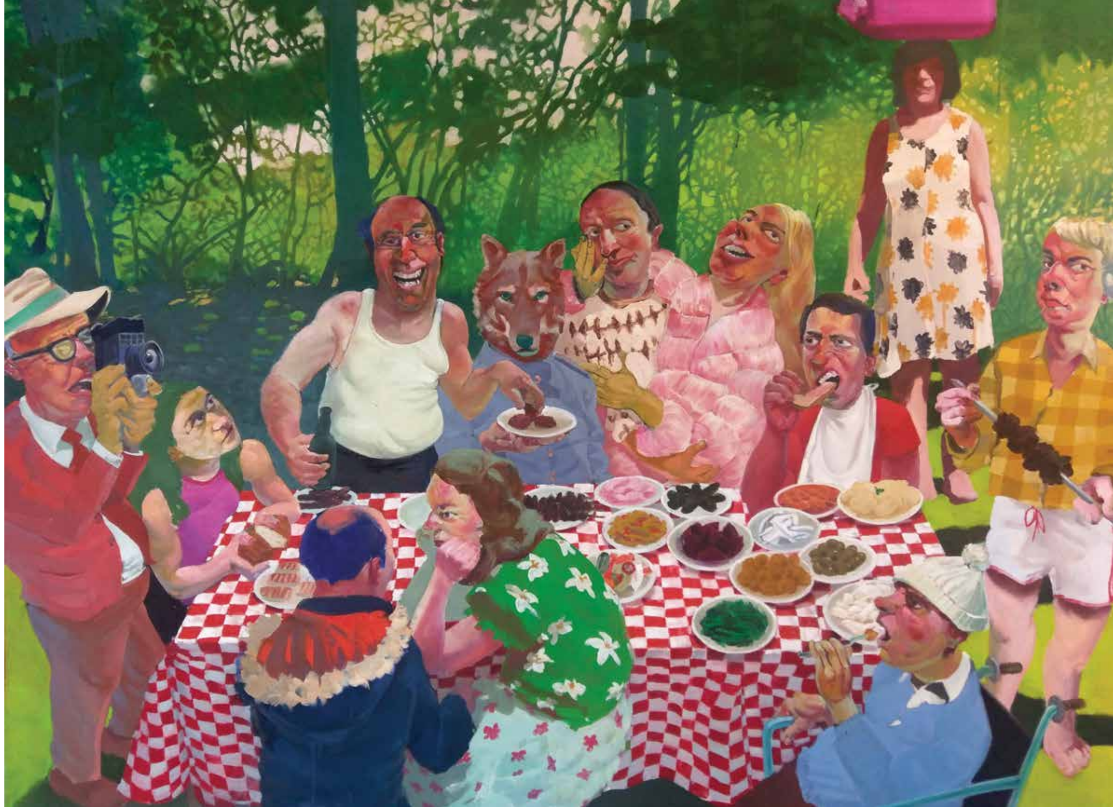
Souvla and Meze with Uncles (2018) oil on canvas 150x200