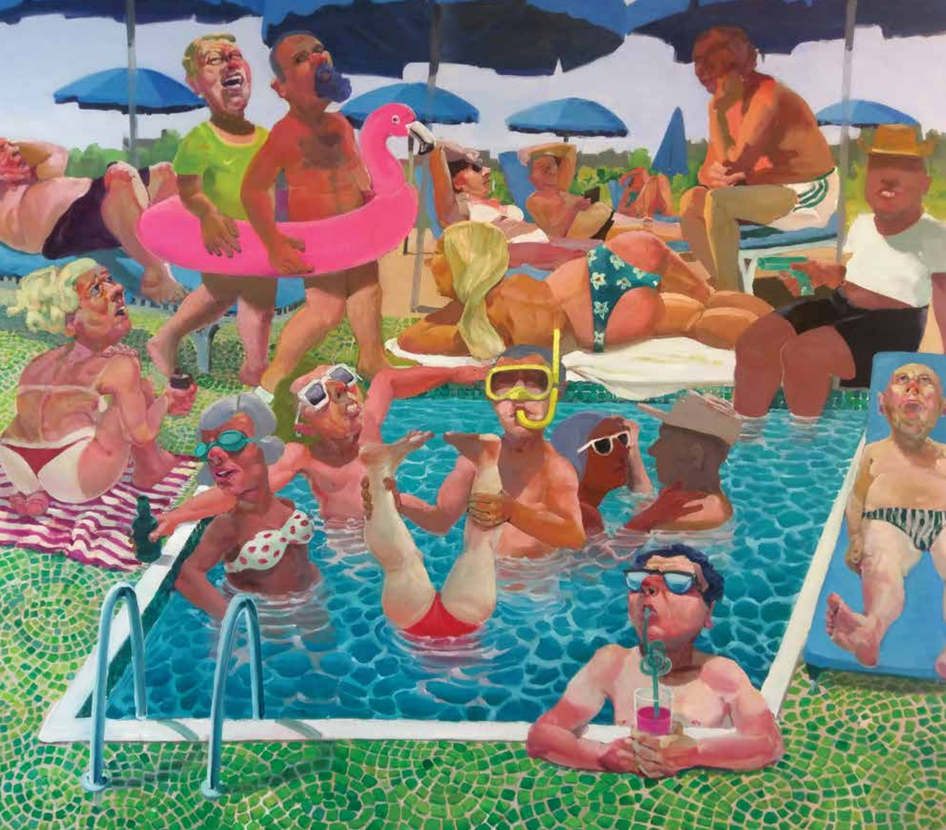
Sunburn (2018) oil on canvas 160x180