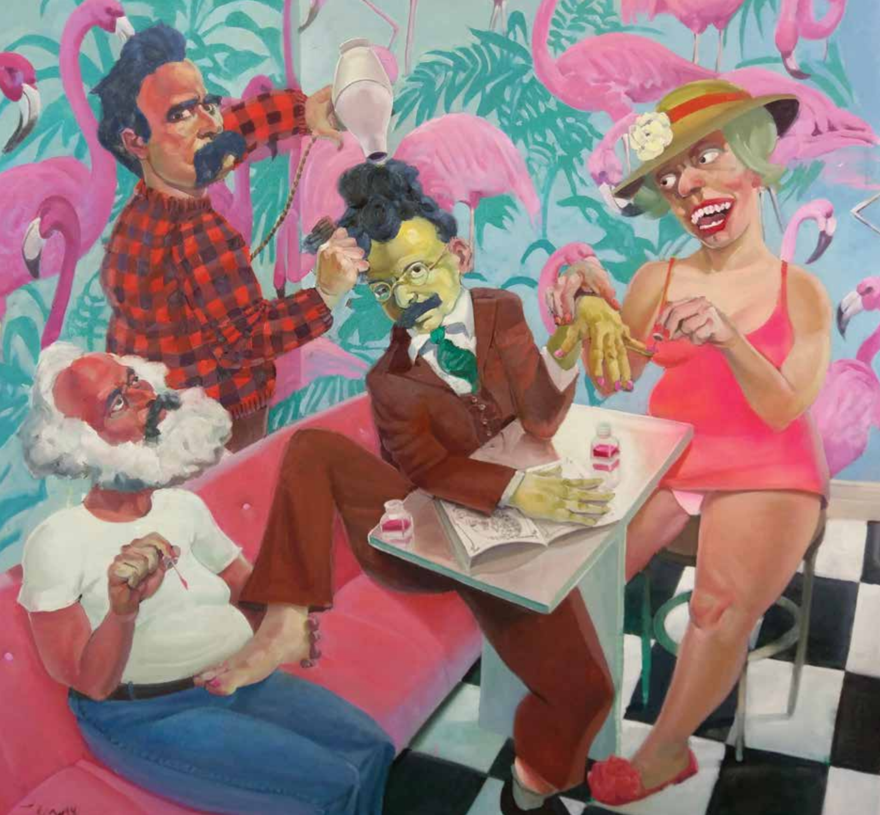
The Philosophers' Nail Bar (2018) oil on canvas 125x130