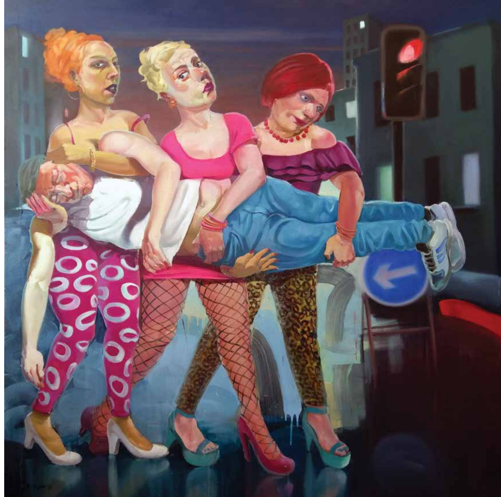
One-Way Street (2019) oil on canvas 148x148