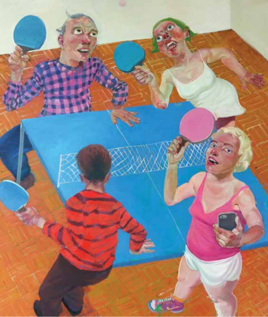
Ping Pong Selfie (2018) oil on canvas 148x125