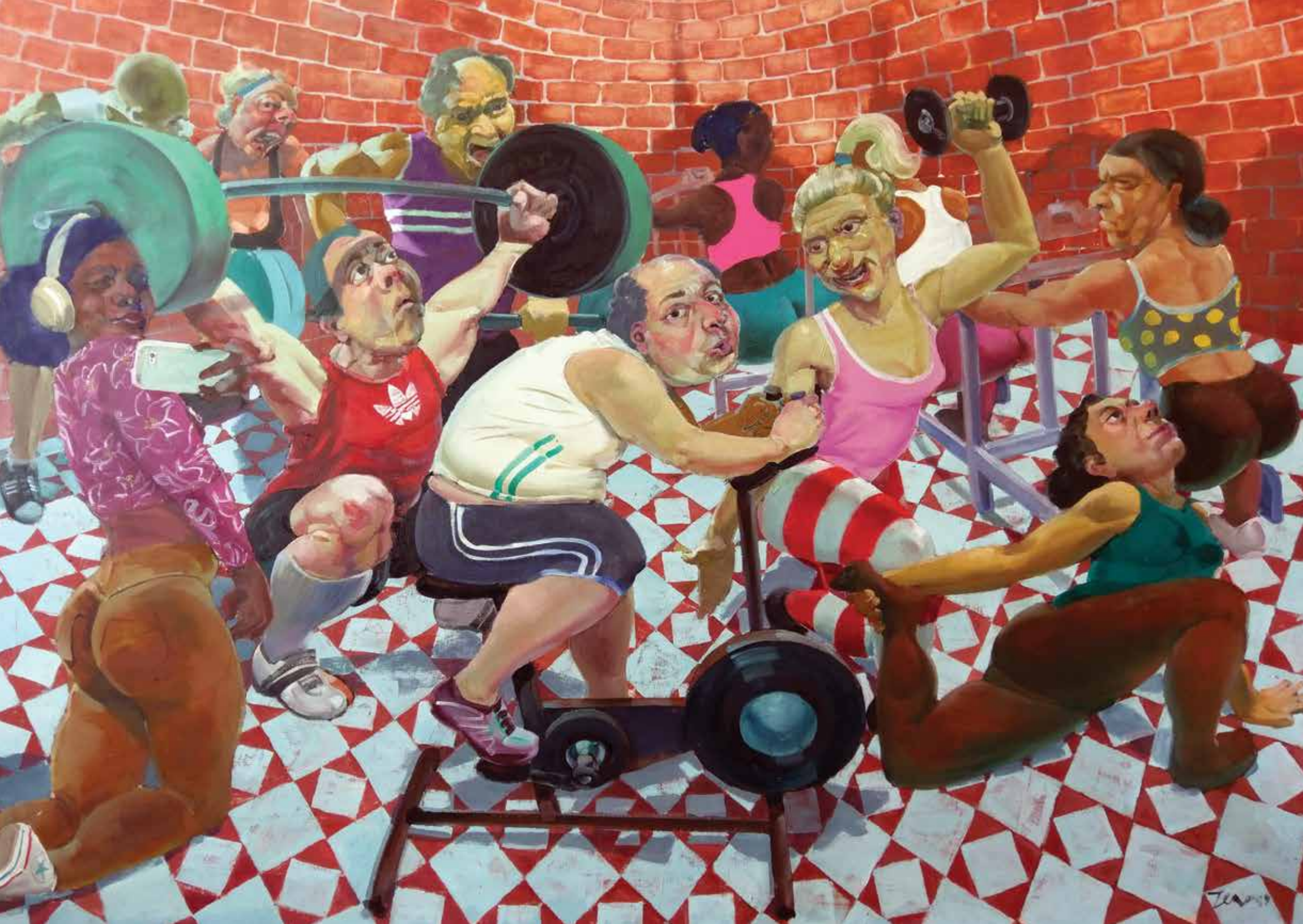
The Panopticon Gymnasium (2019) oil on canvas 130x180