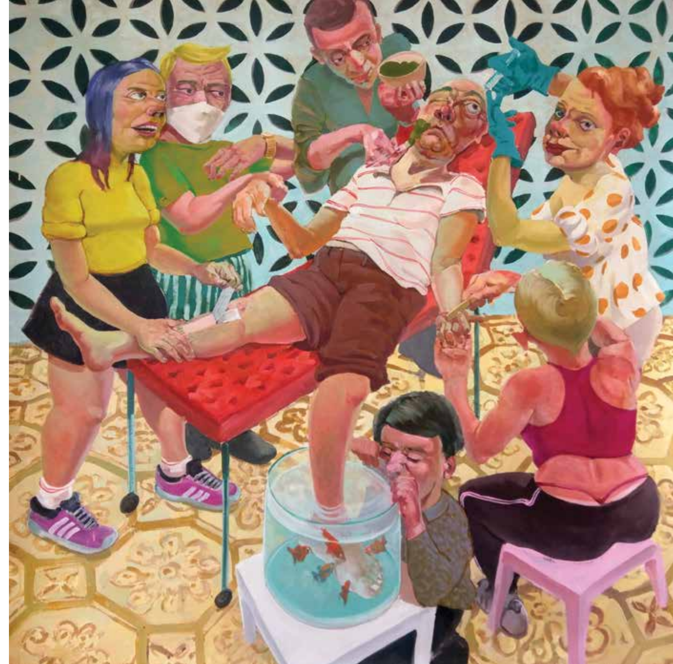
The Hedonic Calculus of Health and Beauty (2019) oil on canvas 148x148