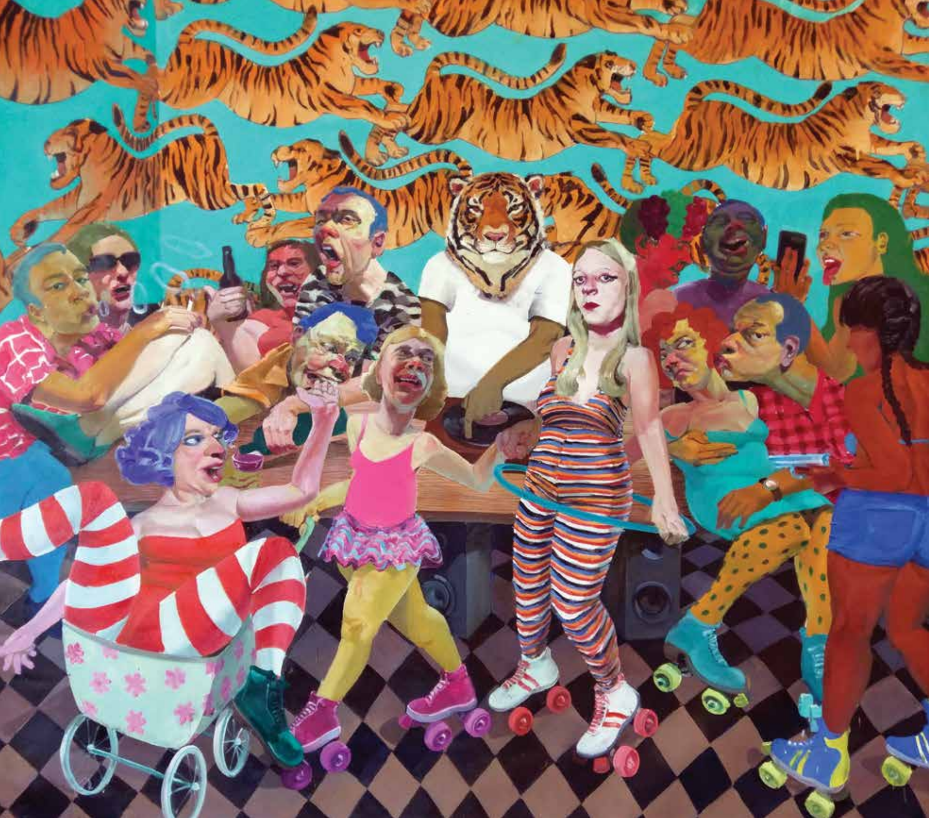
The Tiger Lounge (2018) oil on canvas 160x180