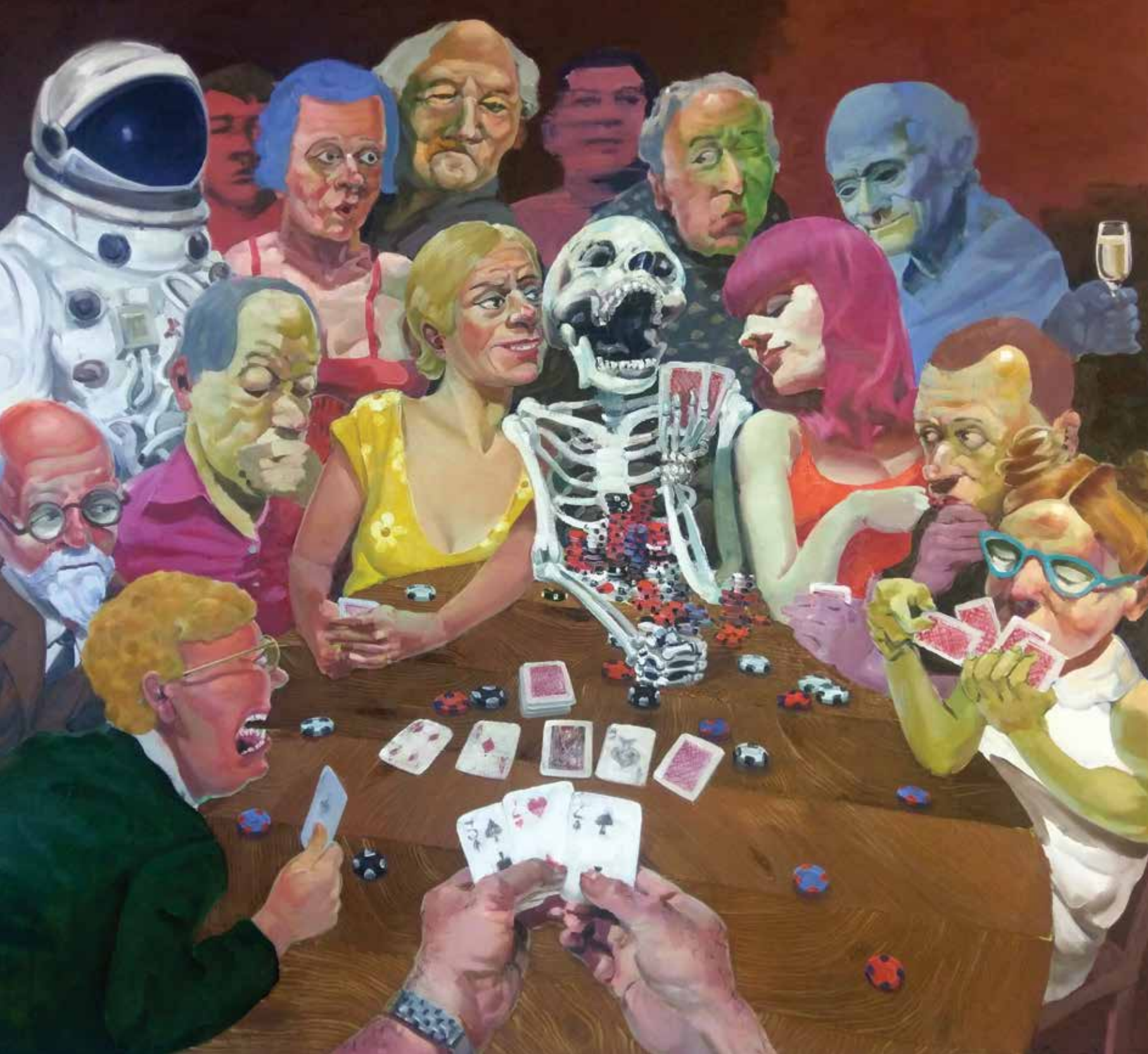
The Gamblers (2019) oil on canvas 135x148