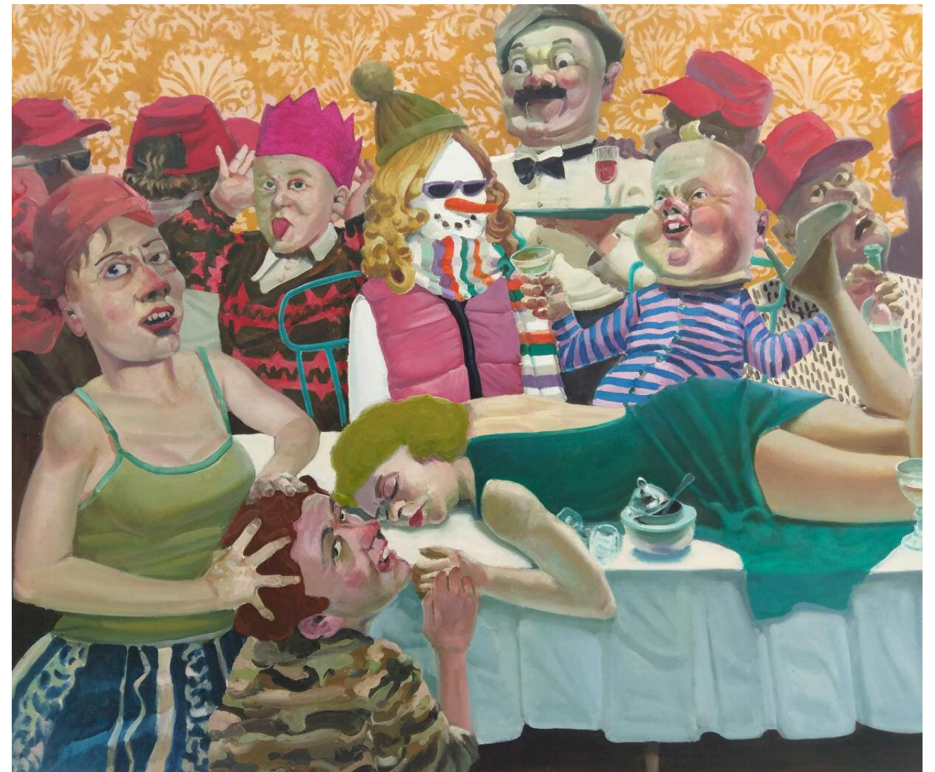
Head Massage [2017] Oil on canvas, 125x148 cm