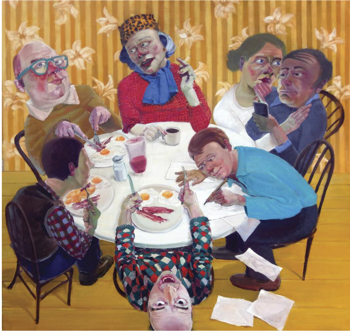
Bacon and Eggs [2017] Oil on canvas, 125x130 cm