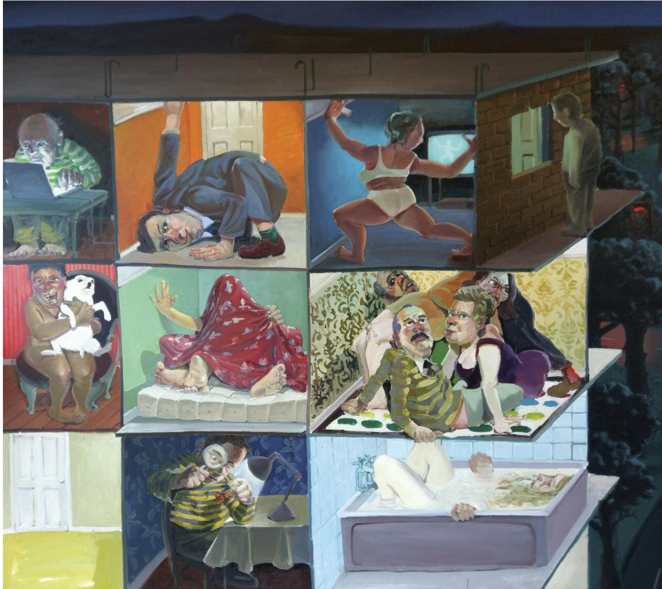
Killing Time [2014] Oil on canvas, 160x180 cm

In troubled and uncertain times it is natural to seek hope and comfort in familiar things. To carry on with the routines of daily life, not ask too many questions, not look too closely or shine too bright a light on things better left alone, unsaid. But the artist's job is to look sideways at these things, and reveal the self-deceptions and illusions of the everyday truths and experiences we might take for granted, choose not to notice.