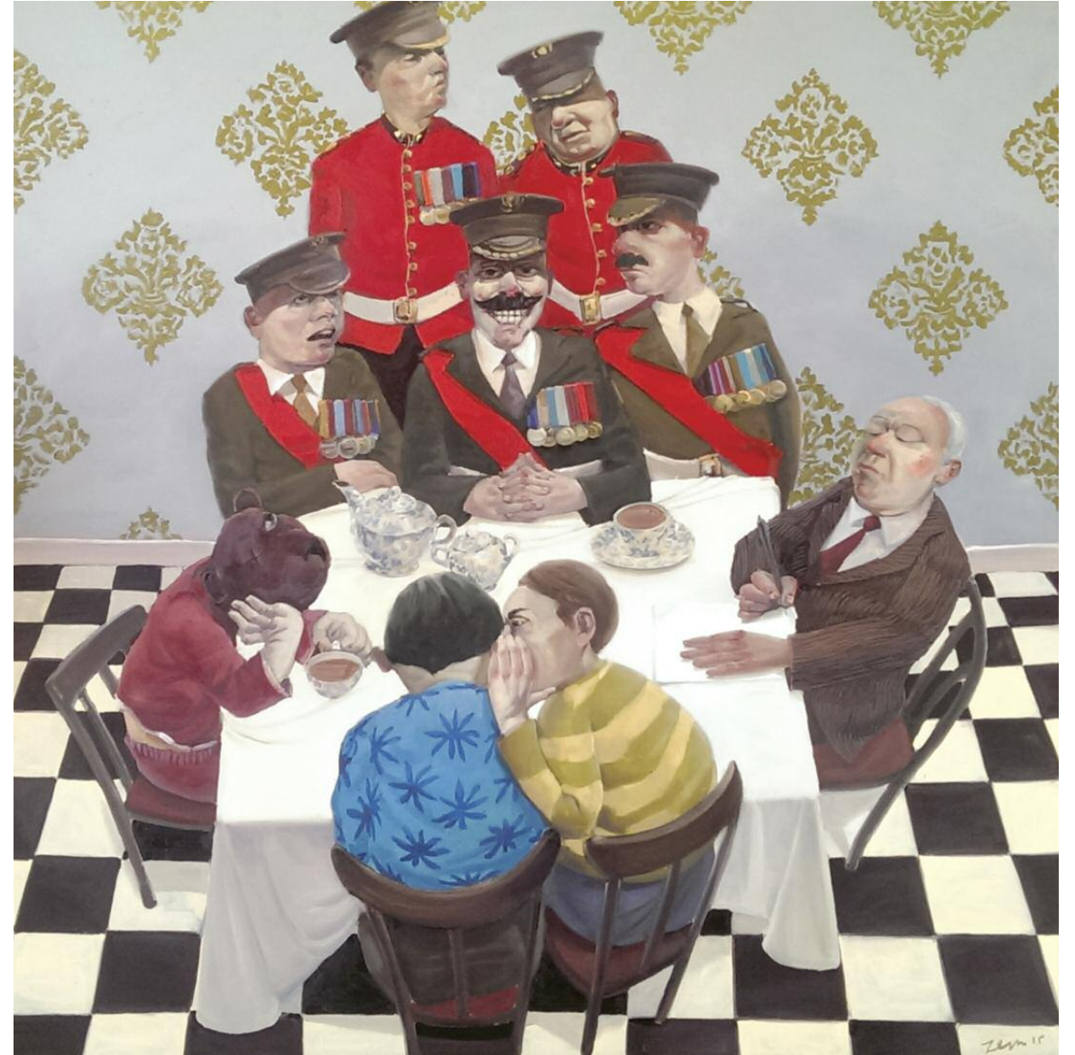
English Tea [2016] Oil on canvas, 125x125 cm