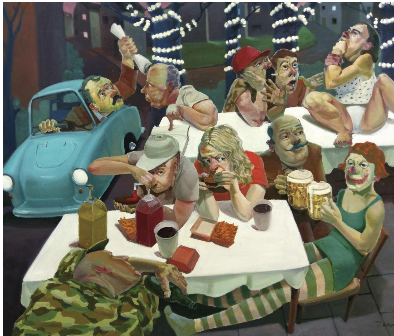
Hamburger with Fries [2017] Oil on canvas, 125x148 cm