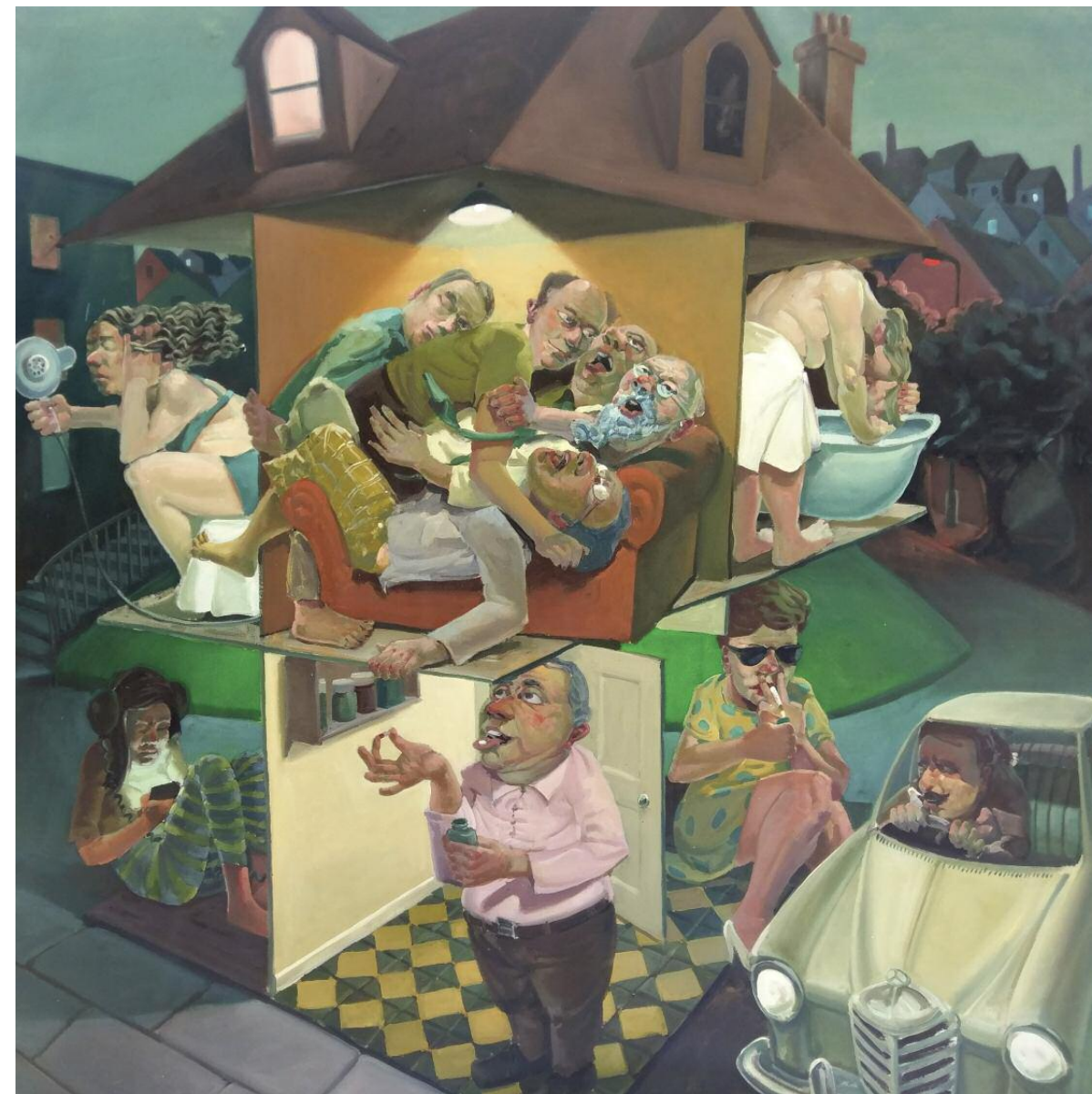
Hypertension [2017] Oil on canvas, 148x148 cm