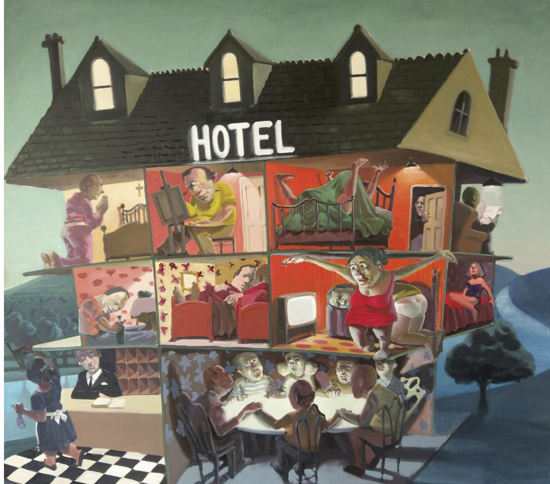
Freud's Hotel [2017] Oil on canvas, 160x180 cm