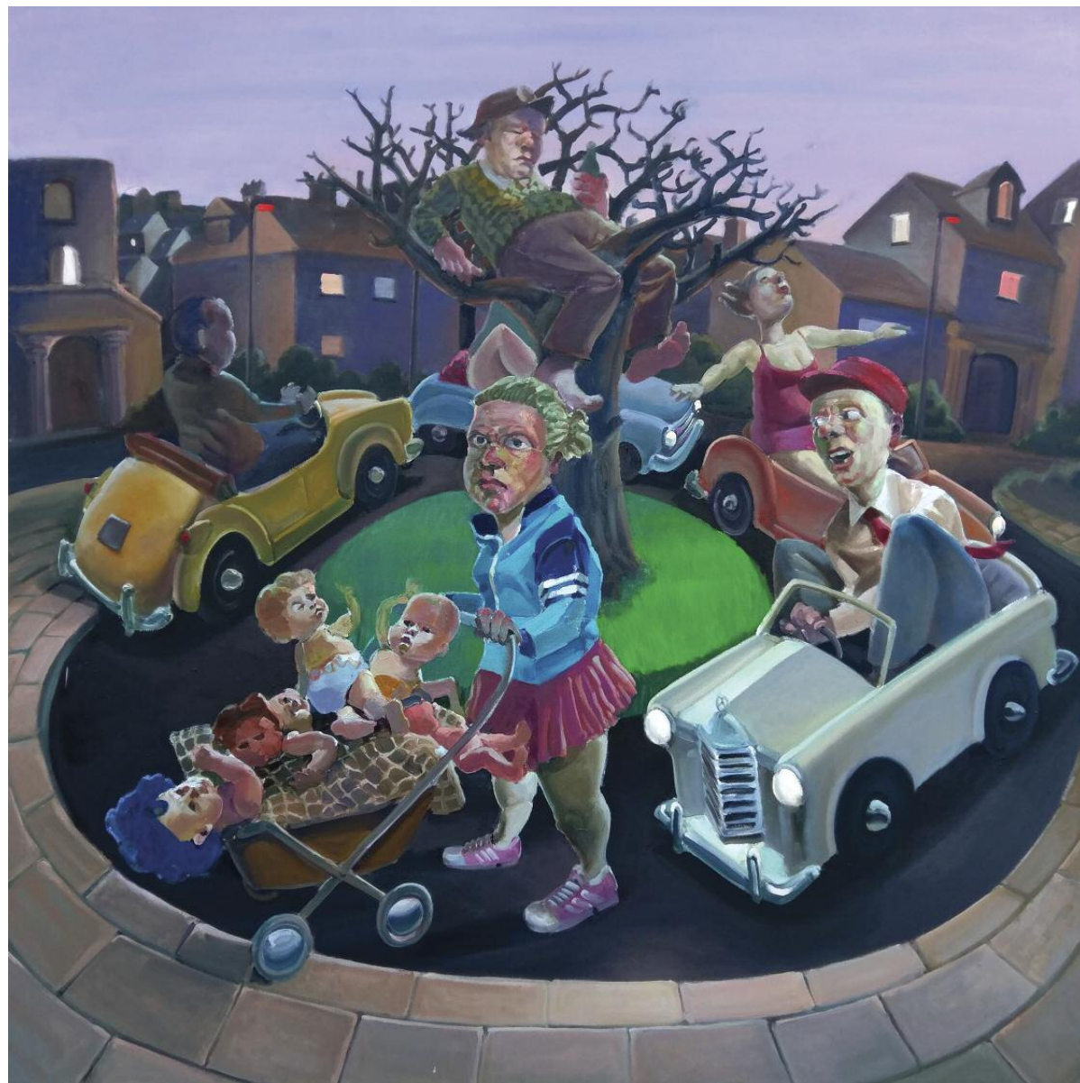
Tragic Roundabout [2017] Oil on canvas, 148x148 cm