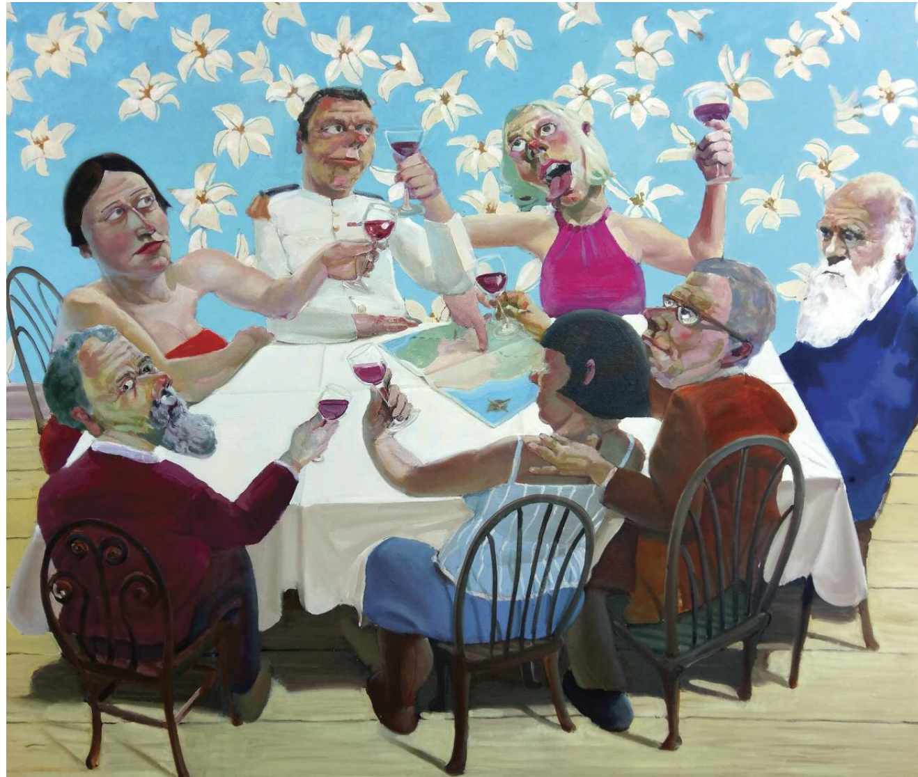
The Destiny of the Species [2017] Oil on canvas, 125x148 cm