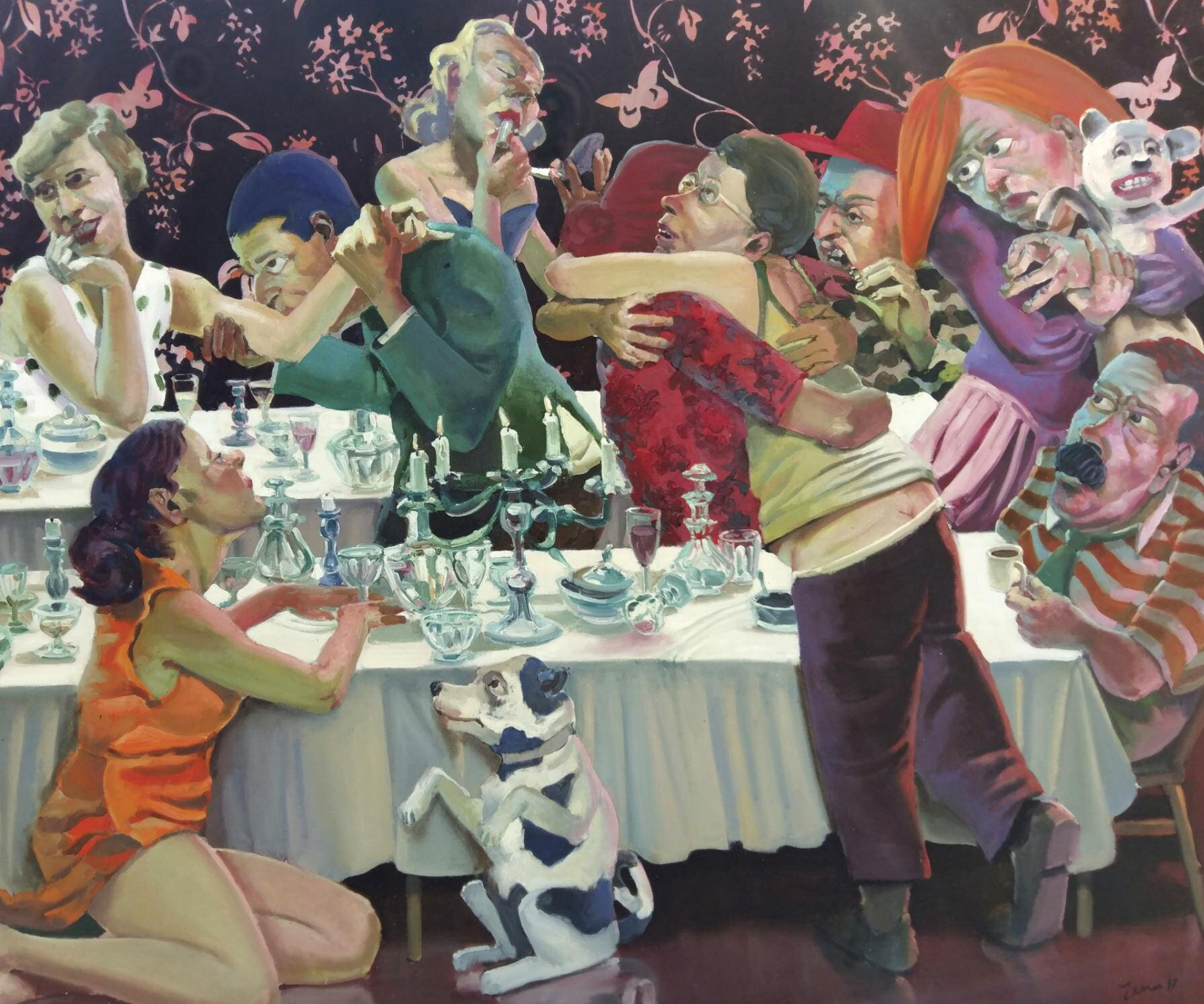
The Uninvited Guest [2017] Oil on canvas, 125x148 cm