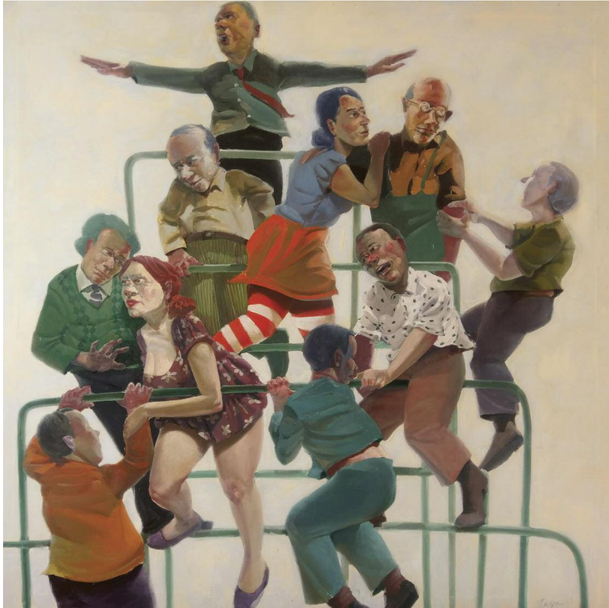
Social Climbers [2016] Oil on canvas, 148x148 cm