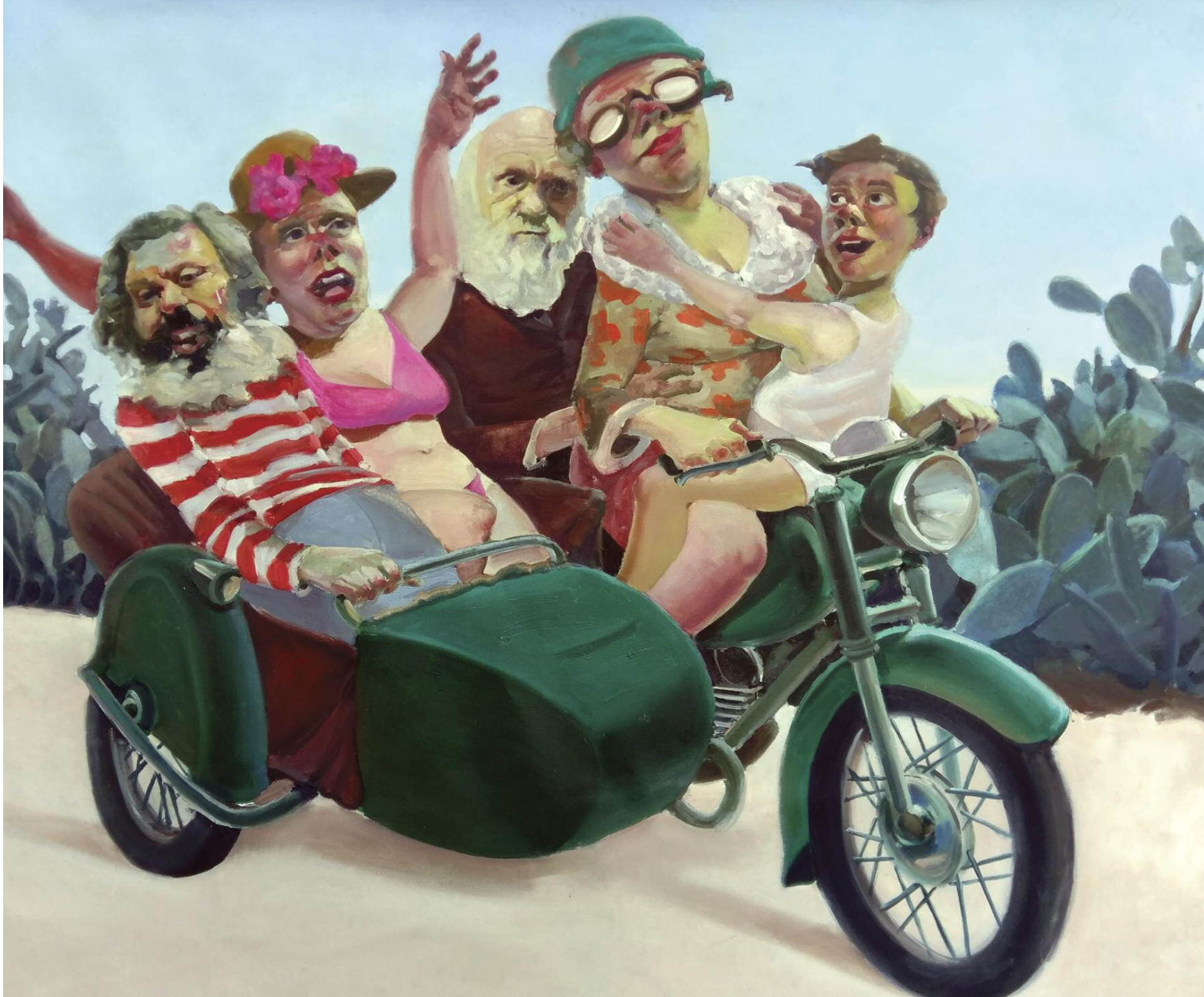
On the Road with Karl and Charles [2017] Oil on canvas, 125x2135 cm