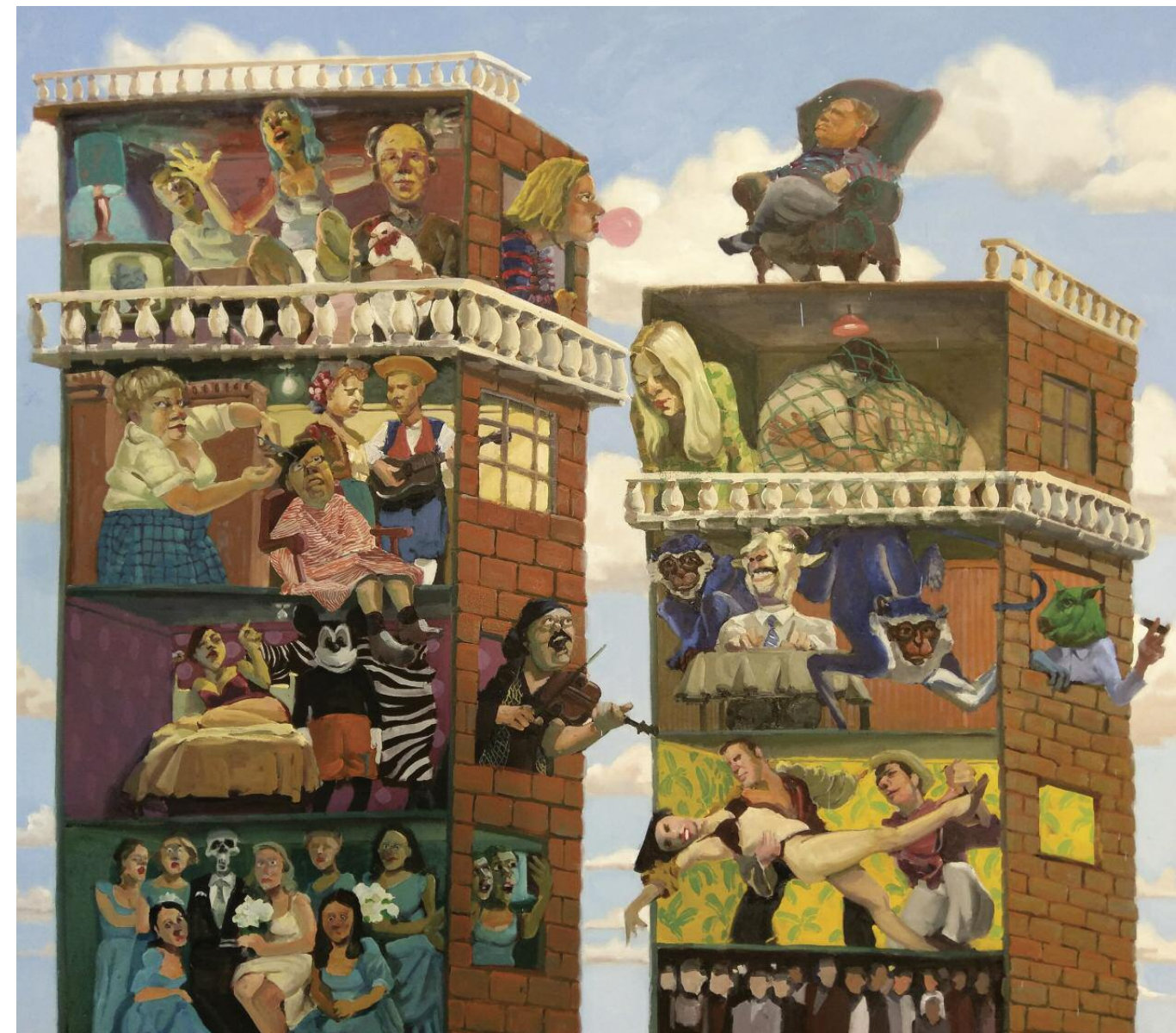
High-Rise of the Absurd [2017] Oil on canvas, 160x180 cm