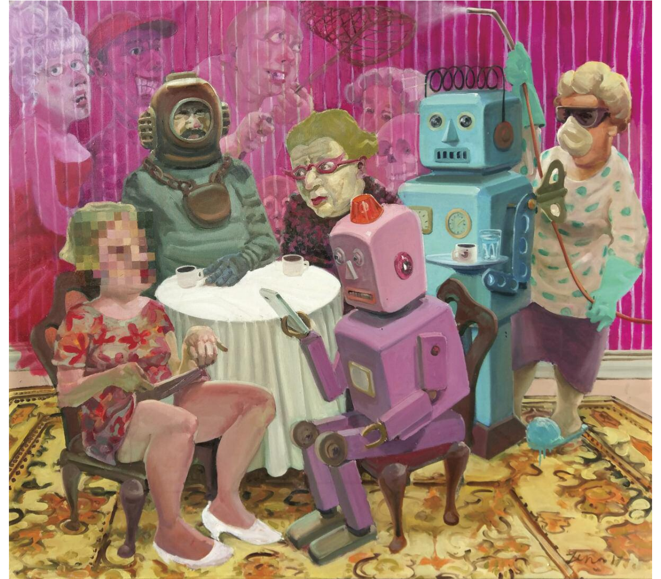
Descent of the Machines [2017] Oil on canvas, 140x125 cm