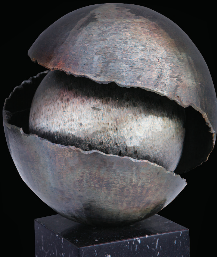
Genesis | iron | 19x22x22 cm