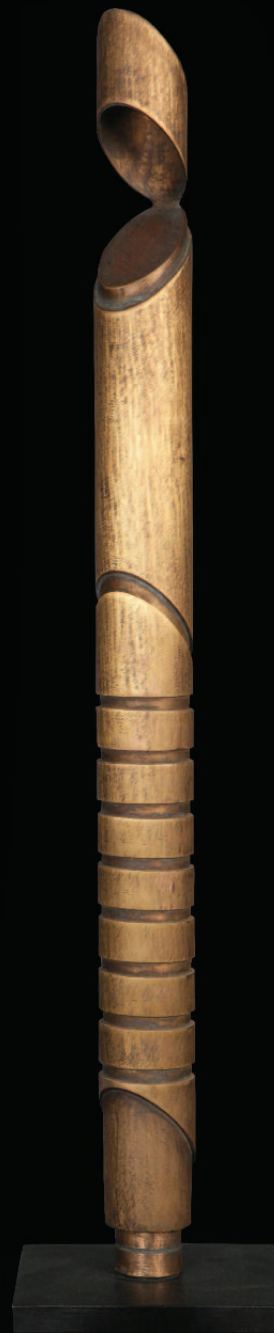
Maiden | 1985 | brass | 83x7x7 cm