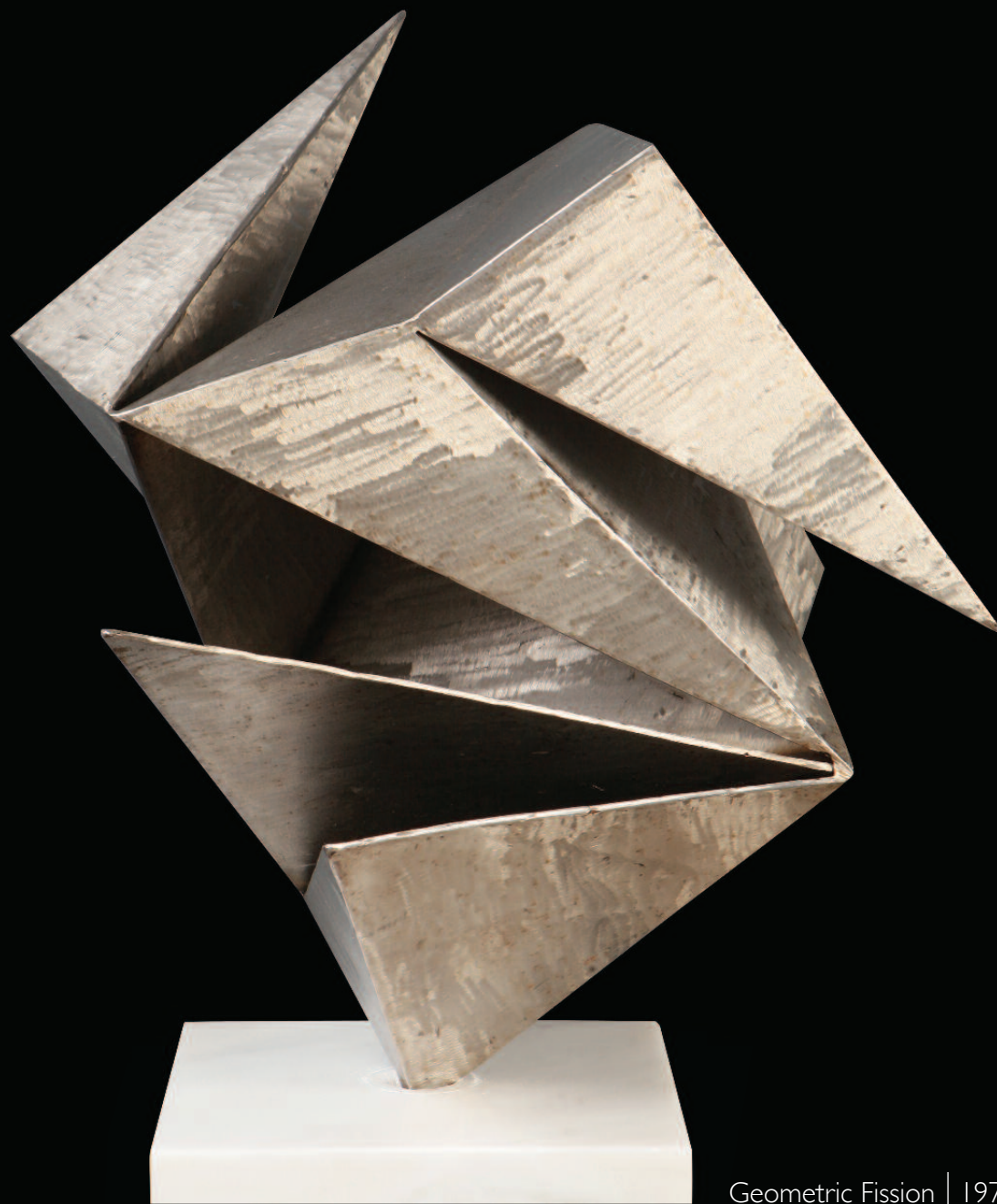
Geometric Fission | 1978 | stainless steel | 54x54x54 cm