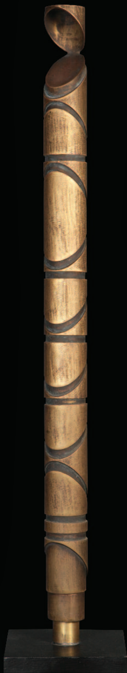
Maiden | 1985 | brass | 93x7x7 cm