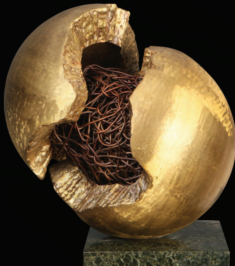
DIMITRIS CONSTANTINOU • SCULPTURE • MARCH 2015 • ALPHA C.K. ART GALLERY