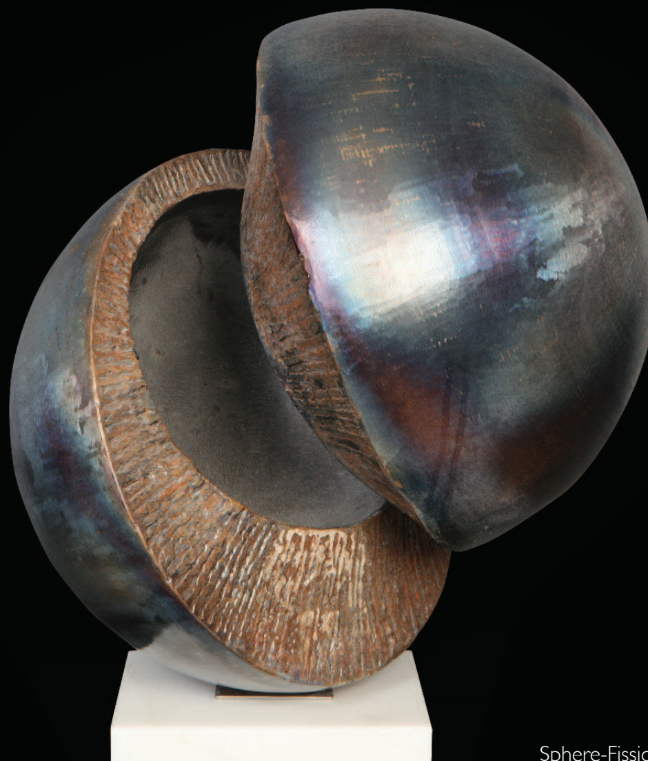
Sphere-Fission I | 1988 | iron | 36x26x32 cm