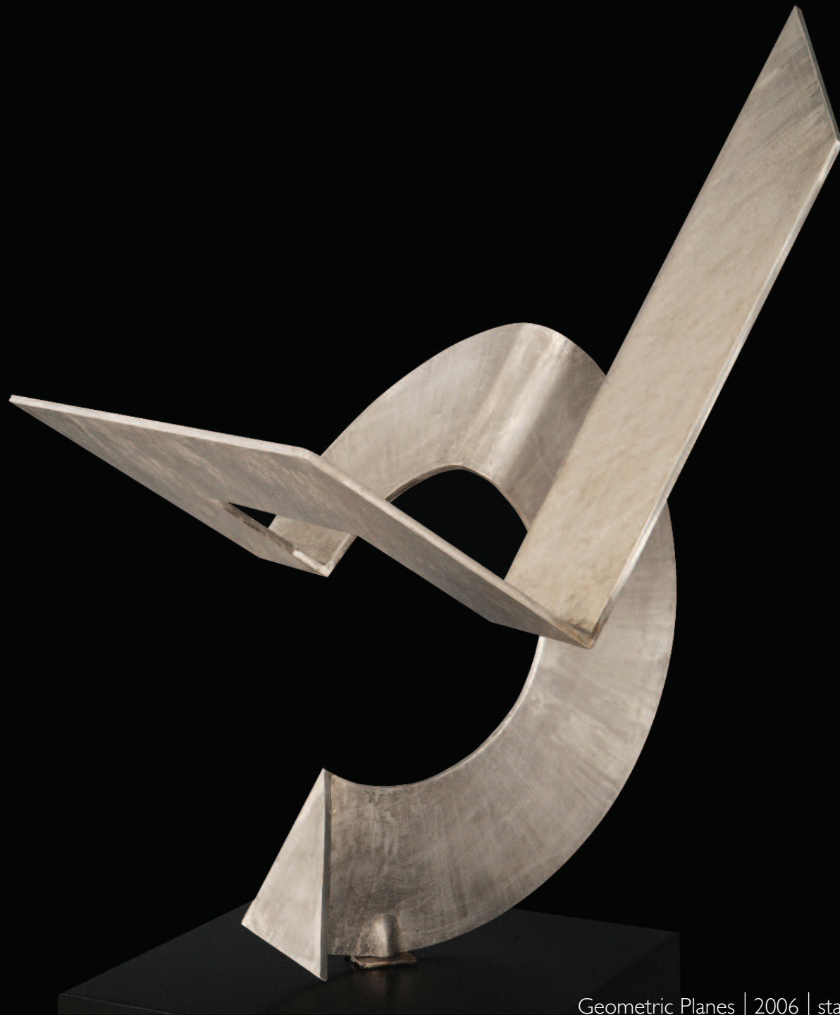
Geometric Planes | 2006 | stainless steel | 100x70x70 cm