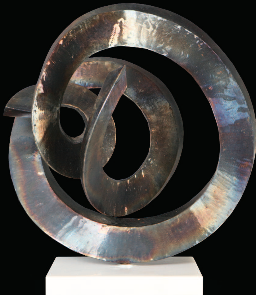
Circular Motion | iron | 43x40x35 cm