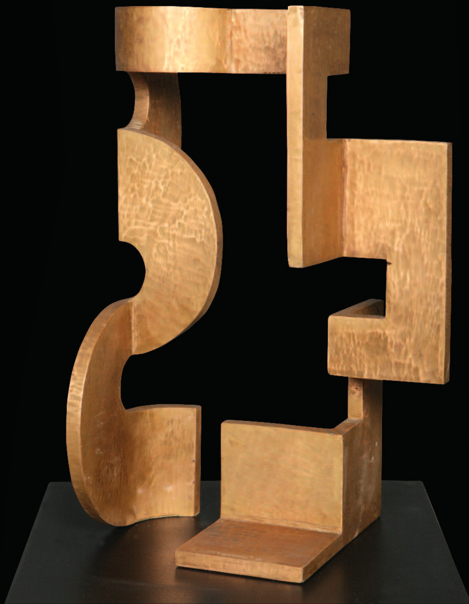
Encounter | 1970 | brass | 45x20x40 cm