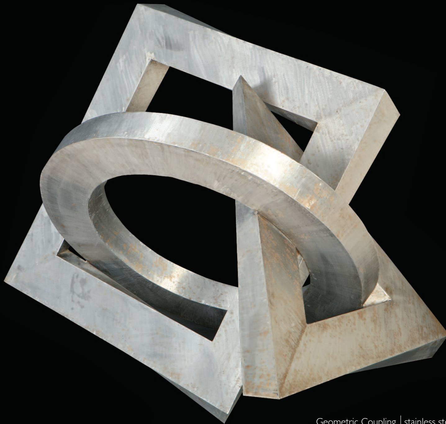
Geometric Coupling | stainless steel | 73x107x88 cm