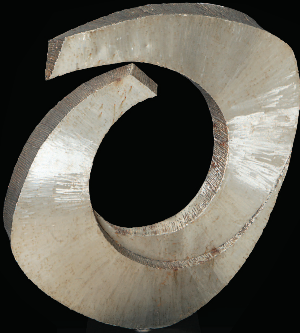
Genesis | 1975 | stainless steel | 110x110x30 cm