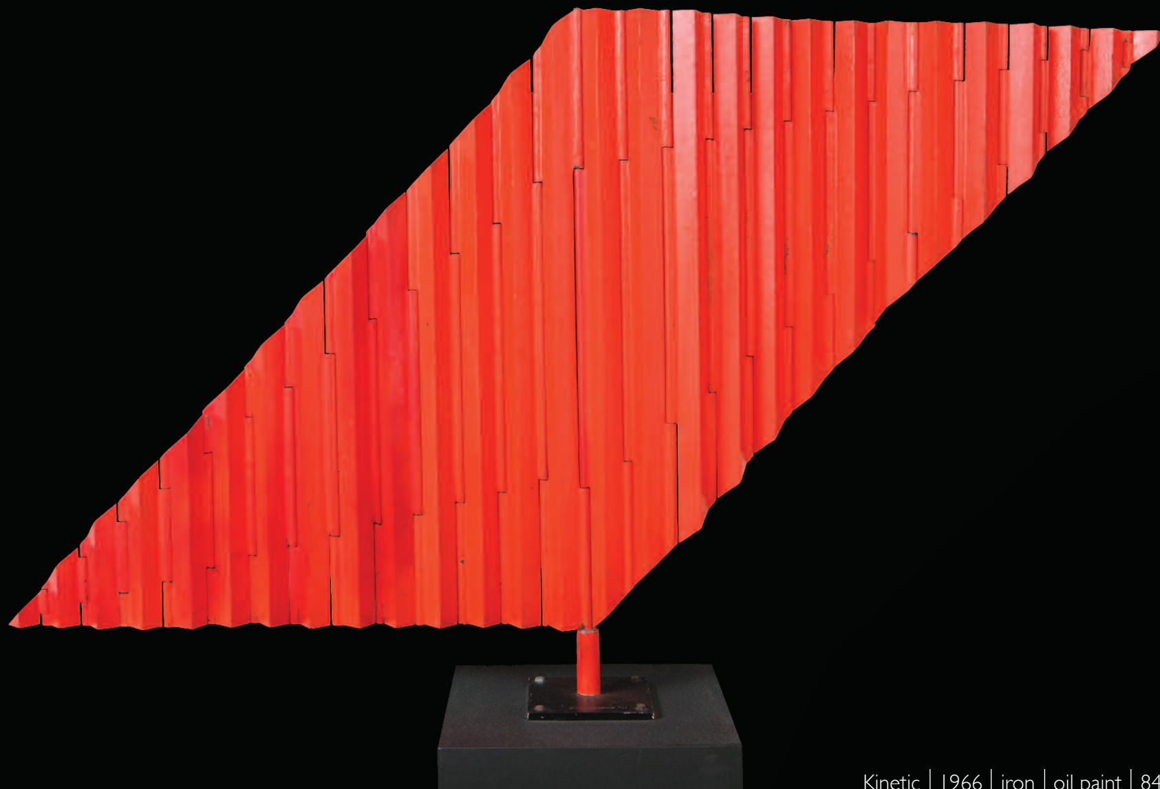
Kinetic | 1966 | iron | oil paint | 84x135 cm