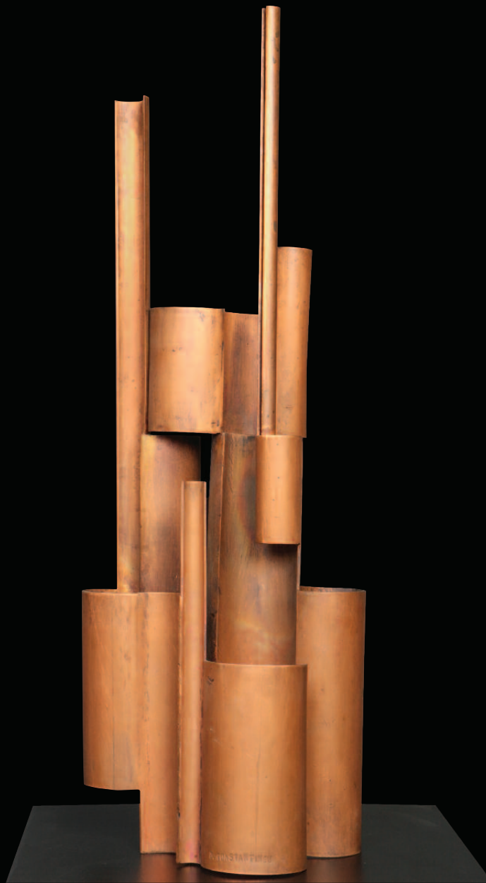
Multi-Dimensional | brass | 66x23x26 cm