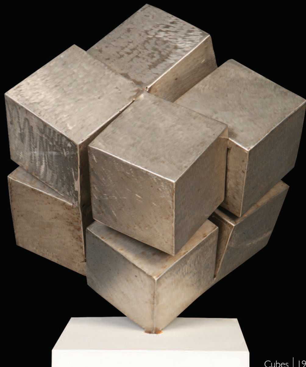
Cubes | 1990 | stainless steel | 38x24x24 cm