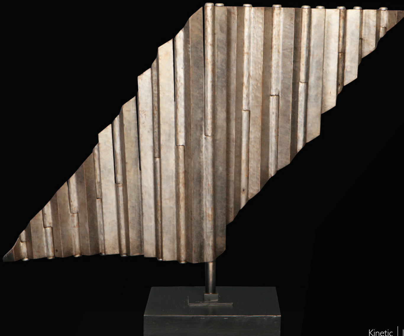
Kinetic | 1970 | iron | 39x64 cm