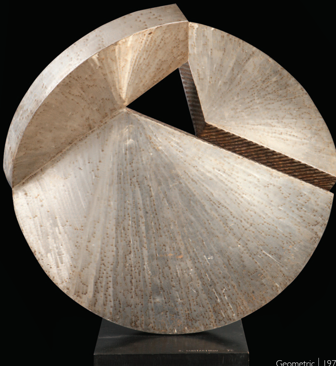
Geometric | 1978 | stainless steel | 60x60x6 cm