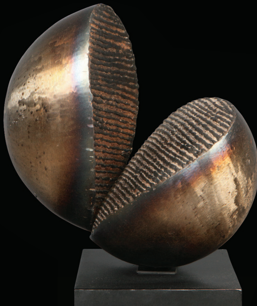
Sphere-Fission II | 1988 | iron | 45x45x45 cm