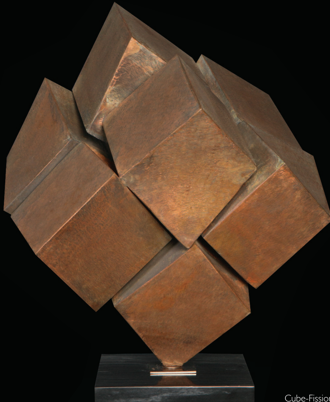
Cube-Fission | 2007 | bronze | 54x54x40 cm