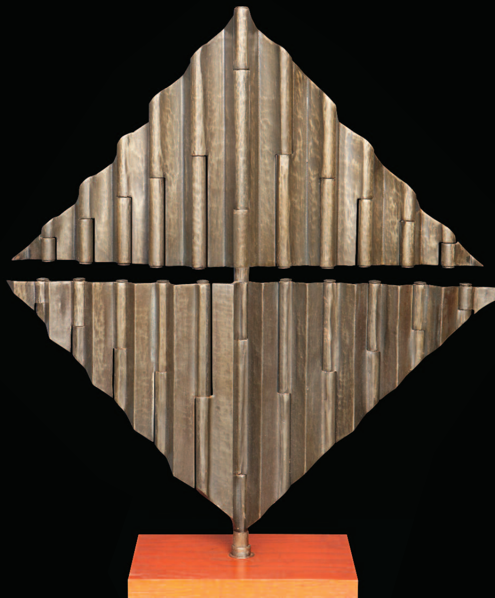
Kinetic | iron | 48x45 cm